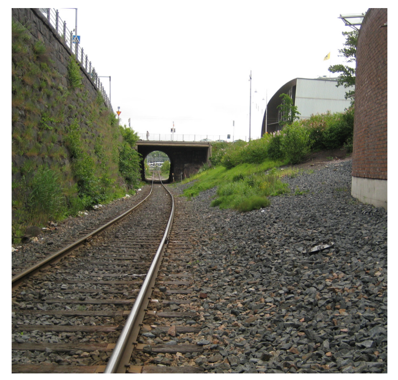
The old railway canyon 2008 - situation before The eastern end to Töölönlahti by the House of Parlament.