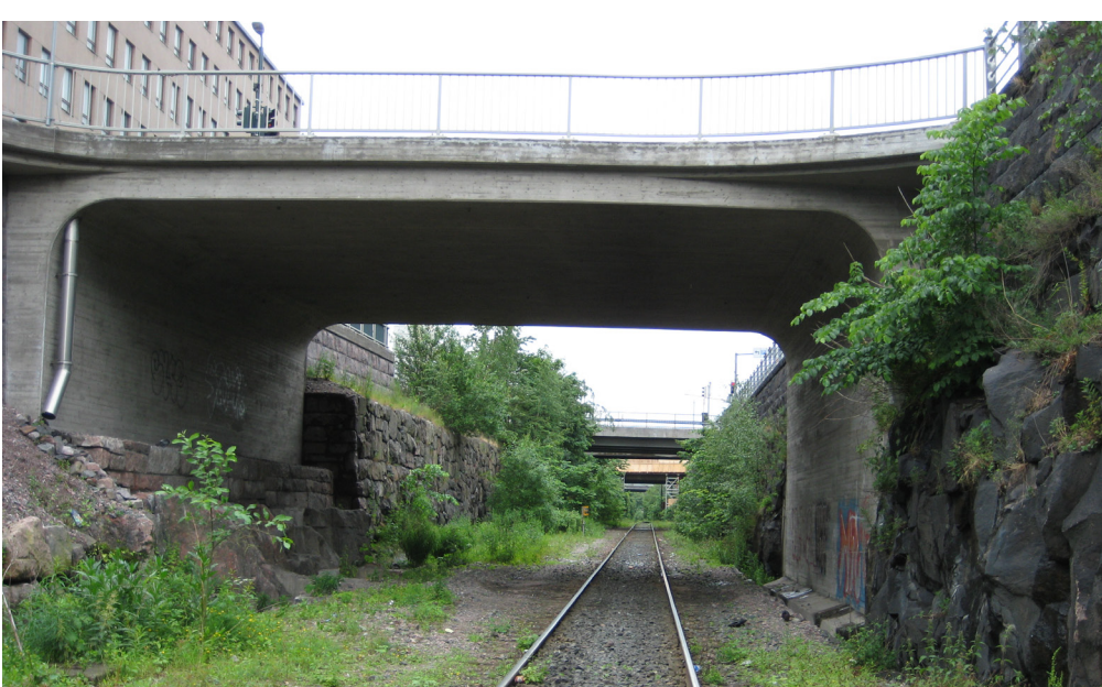
The canyon-like section of the open tunnel.