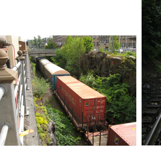
The canyon turns into a green valley.