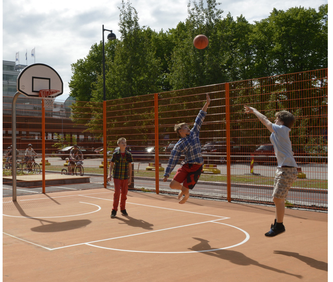
Baana 2013 - situation after