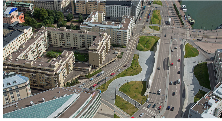
The western end: Länsilinkki.