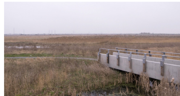
new path, reedbeds and footbridge on the western marshes