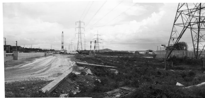
'before' view taken during the Channel Tunnel Rail Link construction - 2004