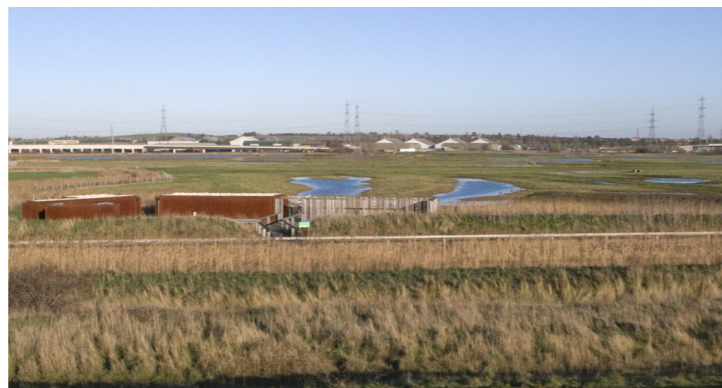
new classroom facilities within their marshland setting