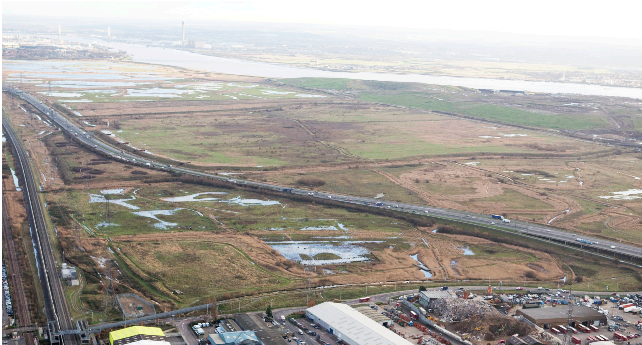
aerial view from the west showing relationship to the Thames