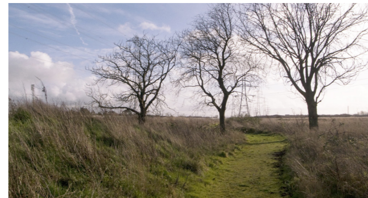
'after' view showing one of the informal path on the western marshes - 2014