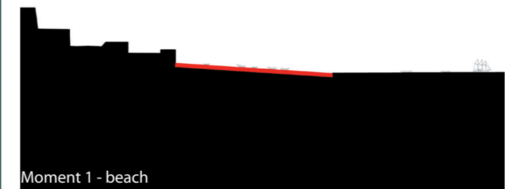
Moment 1 - beach