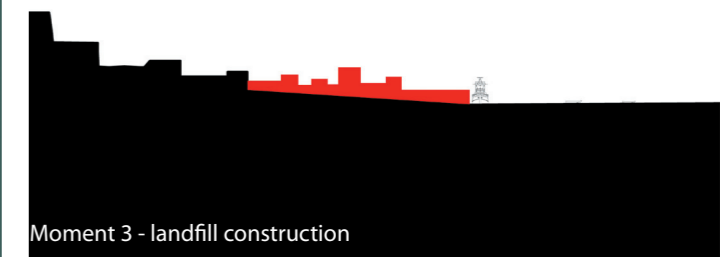
Moment 3 - landfill construction