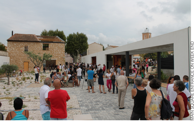
MAIN SQUARE ENTRANCE ON WEEK END