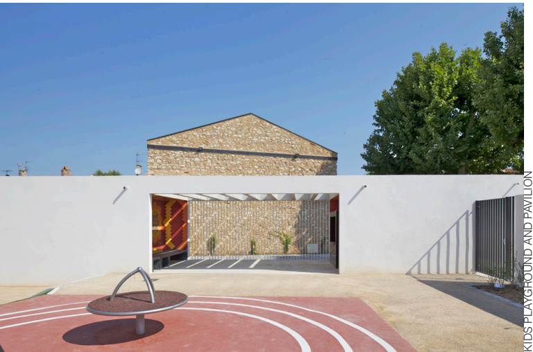
KIDS PLAYGROUND AND PAVILION