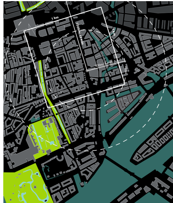
City Centre of Rotterdam and Stadwater

Design Start : 2008 Work start : 2011 Realization : 2012