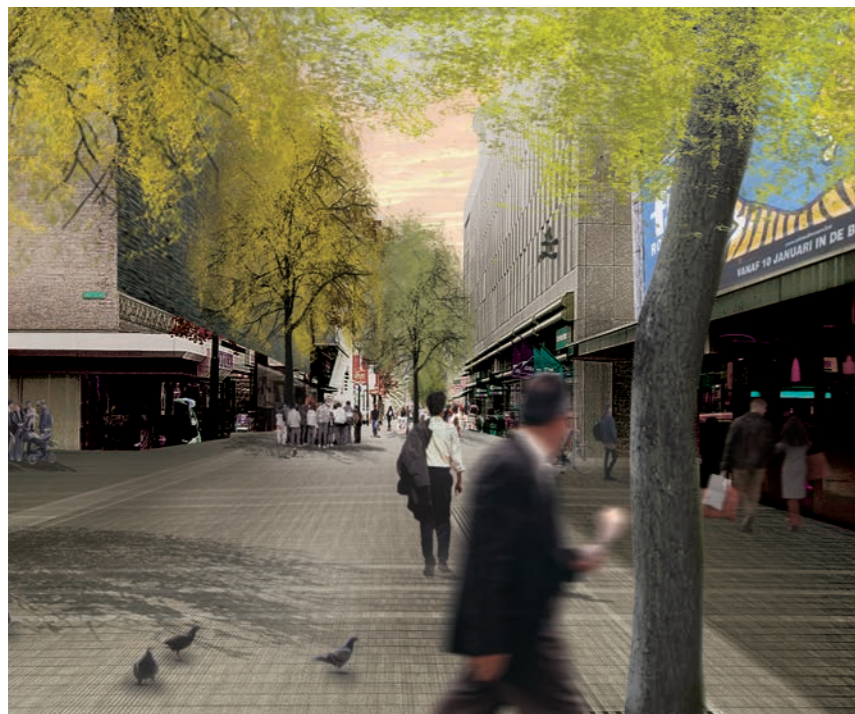
Hoogstraat- City Centre of Rotterdam