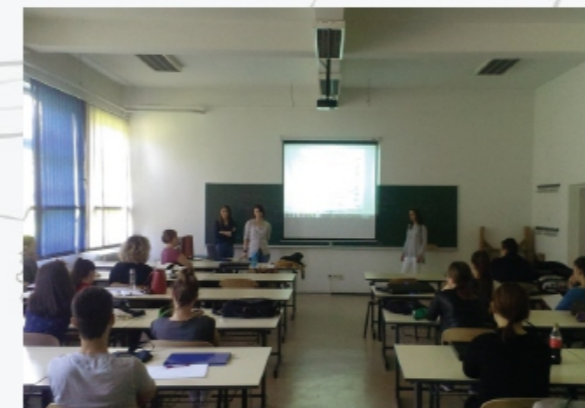
+ finalization of project