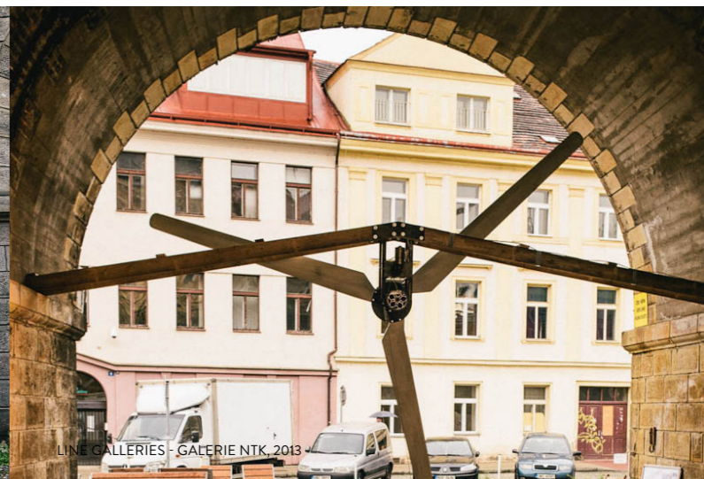
LINE GALLERIES - GALERIE NTK, 2013