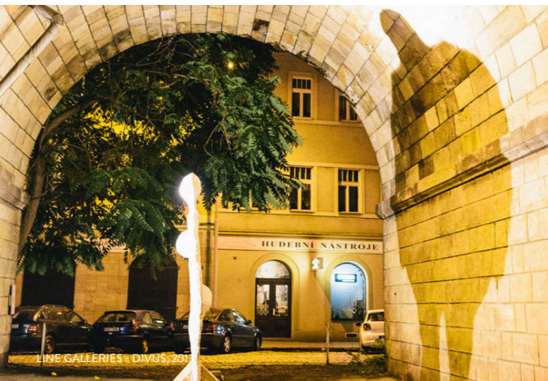
LINE GALLERIES - DIVUS, 2013