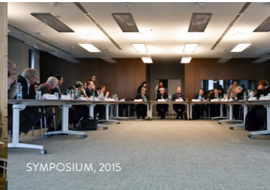
OPEN HOUSE, 2015