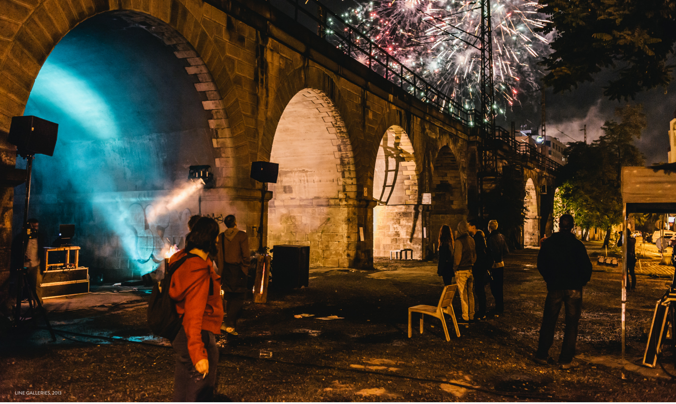
LINE GALLERIES, 2013

OPEN HOUSE PRAGUE - 16.-17.5.2015 within the international organization of Open House Prague, one of the arches of the Negrelli viaduct was opened to the public. The former city paper waste collection was changed by CCEA MOBA into a small ephemeral exhibition space showing the past, present and future of the viaduct.