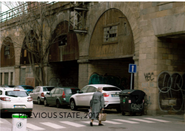
PREVIOUS STATE, 2012