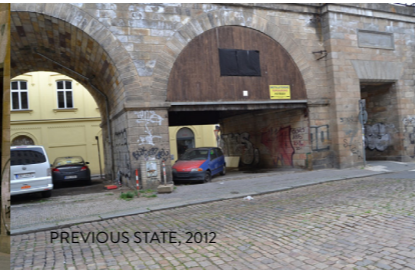
PREVIOUS STATE, 2012