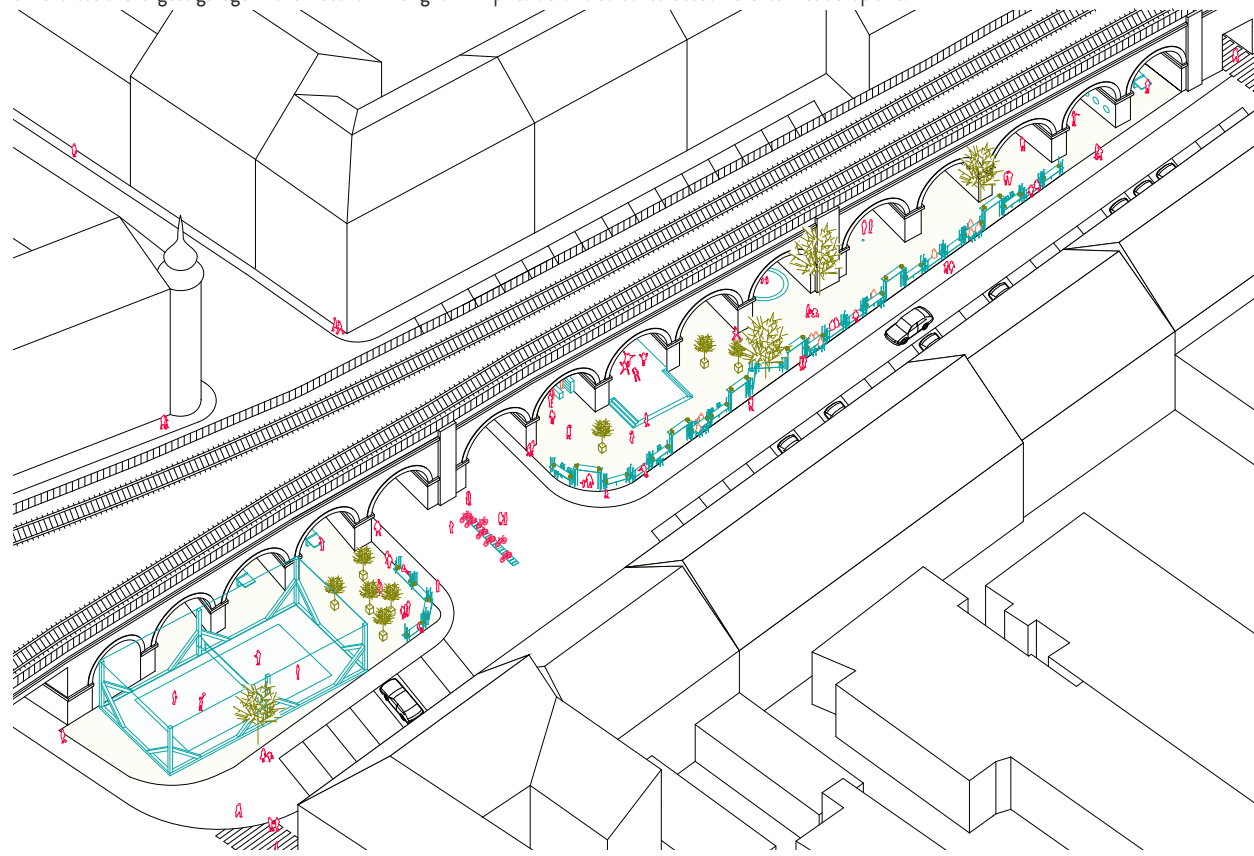
Summer Under the Viaduct axonometric, 201