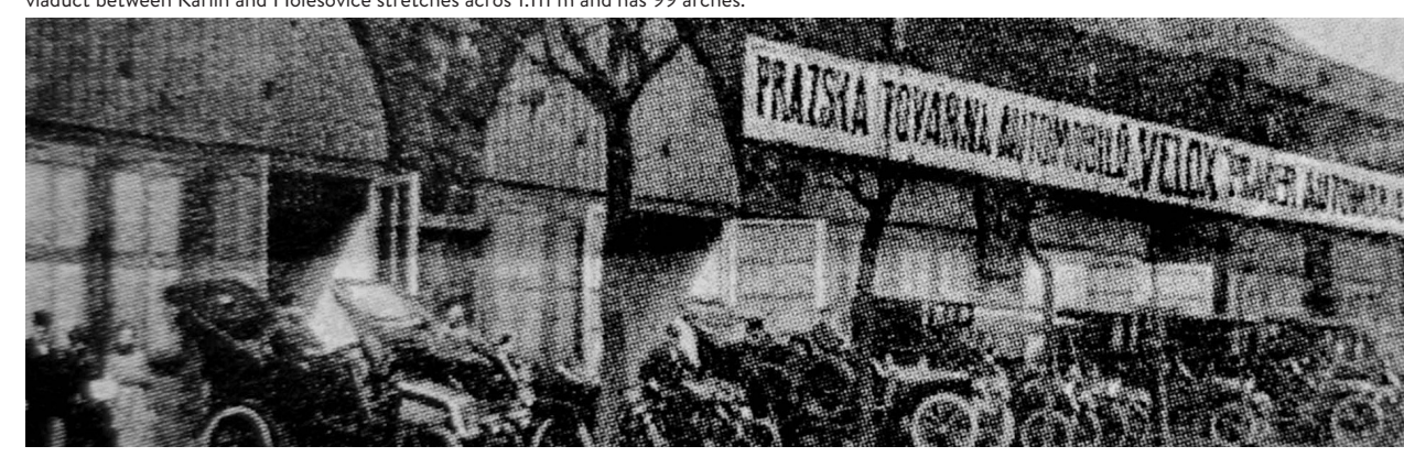
At the beginning of the 20th century Prague company Velox opened under the viaduct the Grand Garage for 50 cars and 100 motorcycles. At the time it was the largest garage in the Austrian-Hungrian Empire. Velox also constructed here its first aeroplane.