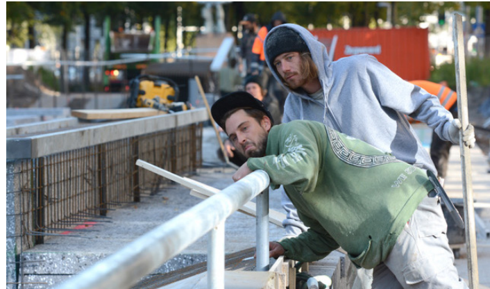
Construction workers were also skateboarders.