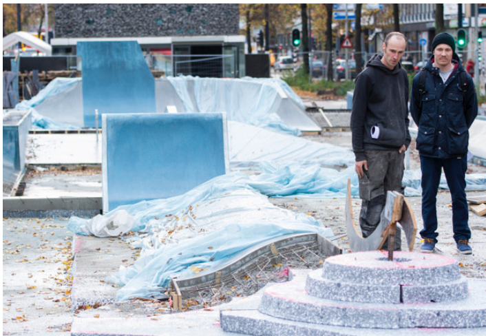
Details were carefully thought between the designers and builders.