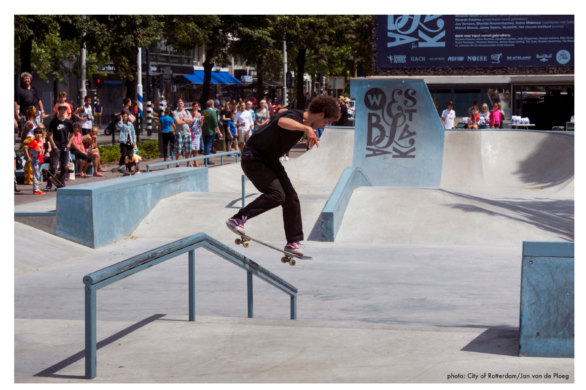
Westblaak is a relaxed place to skate, but it also gives challenges for pro's.