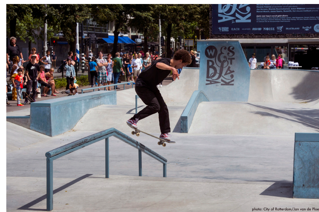
Westblaak is a relaxed place to skate, but it also gives challenges for pro's.