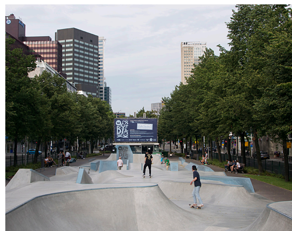
AFTER: customized space that invites all citizens to enjoy.