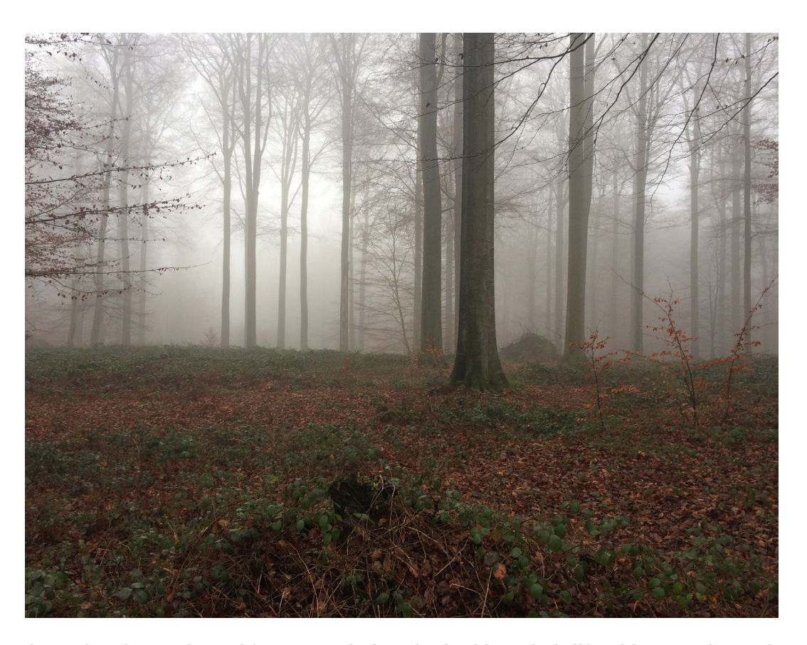
A tree has been planted for every victim who had lost their life; thirty-two in total.

After extensively exploring the forest, we found a natural clearing on top of a hill, and surrounded by majestic beech trees.