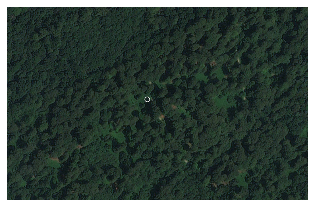
floor, appeared to us as the right location.

The Sonian forest adjacent to the city centre, with its untouched forest