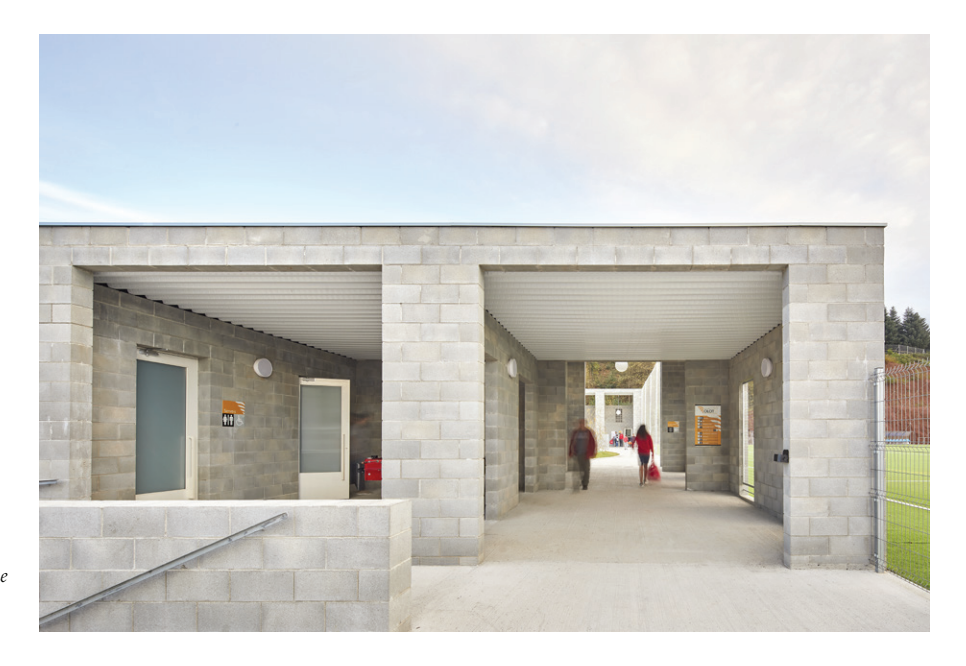
Agora. Setting for socialisation in the El Morrot sports complex