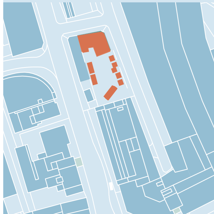
1:1250 LOCATION PLAN