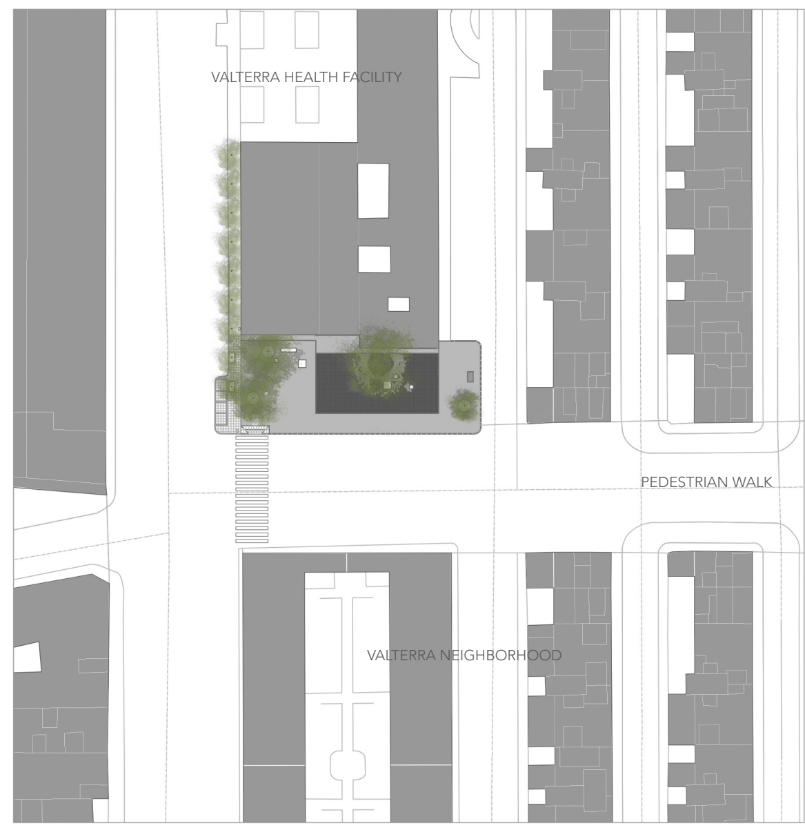
GENERAL PLAN s: 1:200 SITUATION s: 1:750