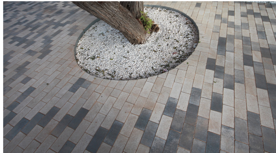
PAVEMENT WITH TREE SHADOWS GRAPHIC