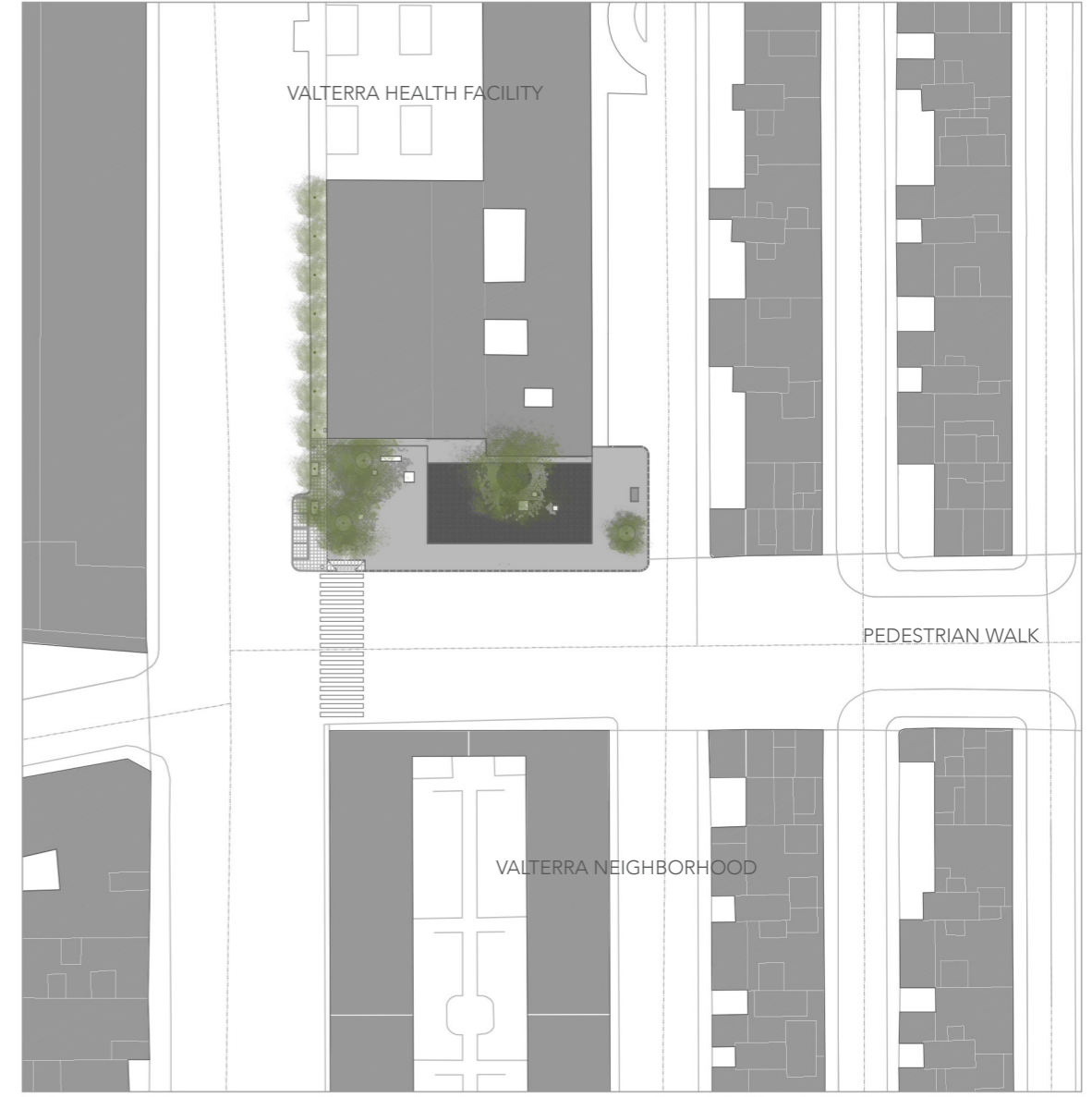
SITUATION s: 1:750