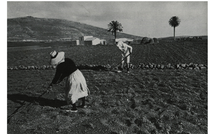
LOCAL AGRICULTURE WITH DARK VOLCANIC GRAVEL PICÓN