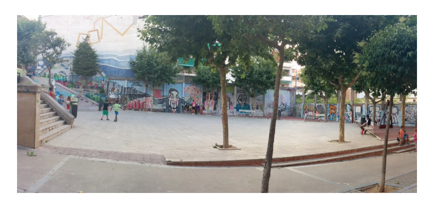
Plaza Joan Miró before the intervention _Summer 2014

Therefor, in the second phase the executive reform of the plaza was finalized, reflecting the accordances of the previous one. The agreed concept seek to reinforce the identity of the plaza reclaiming its centrality to the city.