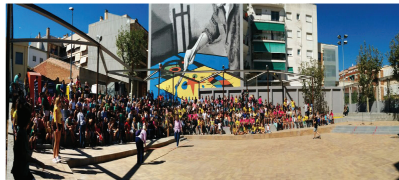
Public waiting for the inauguration of the event_ Battle Dance_September 2017

Therefore, in the second phase the executive reform of the plaza was finalized, reflecting the accordances of the previous one. The agreed concept seek to reinforce the identity of the plaza reclaiming its centrality to the city.