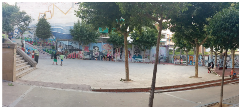
Plaza Joan Miró before the intervention _Summer 2014

The physical space of that urban square, was consisted by two main levels. On the upper part there was a small landing with a bench next to the degraded allegorical mural and a tree. The access to the lower part was happening by the pedestrian street Jacint Verdaguer or by two staircases that were forming an amphitheater. This zone was consisted by trees on the margins, a playground on the two sides next to the school's wall and a pavement of substandard condition which was leading to the pedestrian street Jacint Verdaguer; a significant extension of the square where bar's and school's entrances could be found.