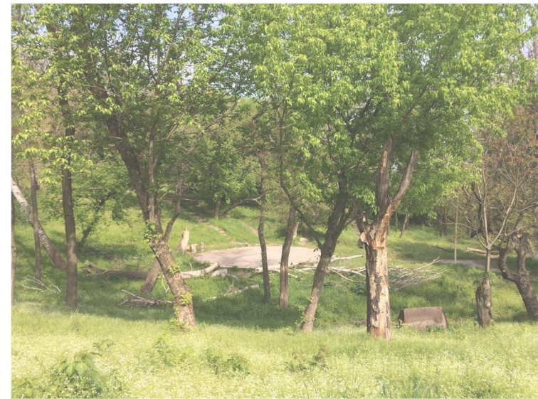
Site in spring 2017