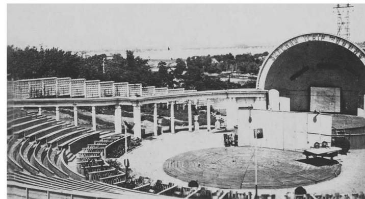
Old Green Theatre scene 1927 — 1942 Rebuilt few times. Purged in 1942.