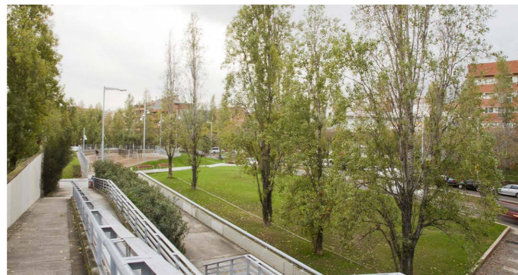
The project site is a road junction generated in the 90s.

Barcelona City Council commissioned the project for the location of a new dog area. It should be part of the new municipal plan to provide dog areas of high quality and it was the first one (a pilot experience).