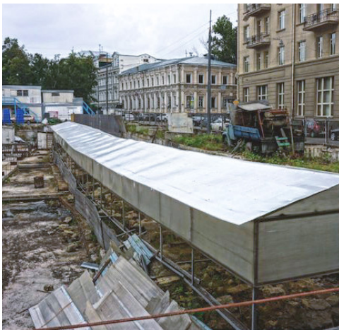
Halted construction leaves a giant pit