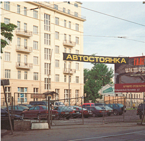
A parking lot