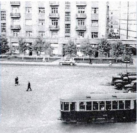
A tram turning spot