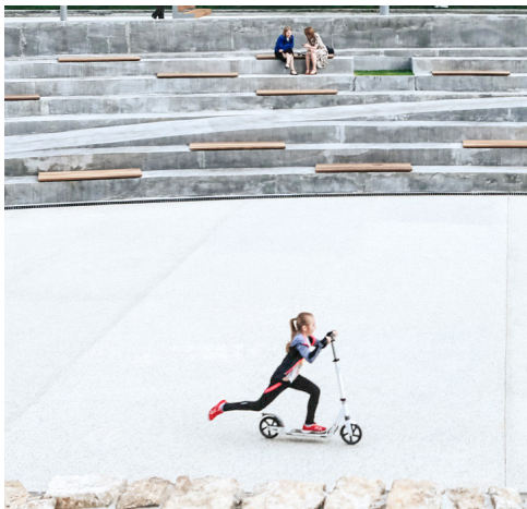
Open-air archaeological exhibition