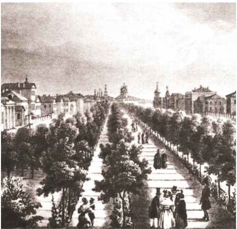
City walls taken down giving way to a chain of boulevards