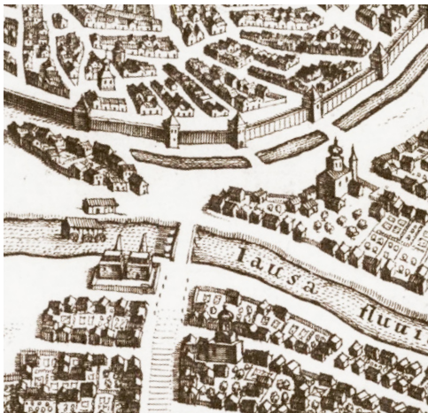
Bely Gorod defense walls erected