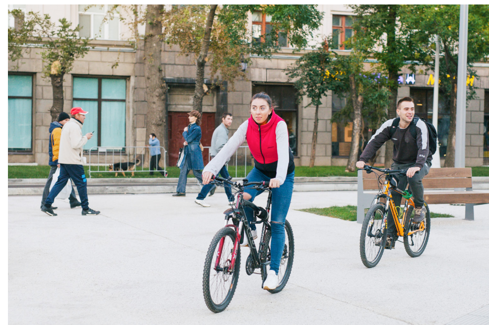
The square made the city more bicycle-friendly