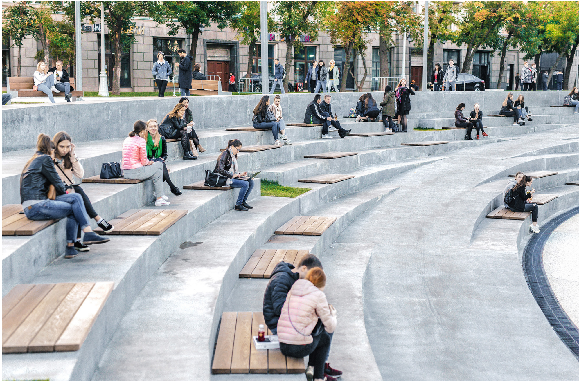
The urban amphitheatre is a chain link of the Boulevard Ring