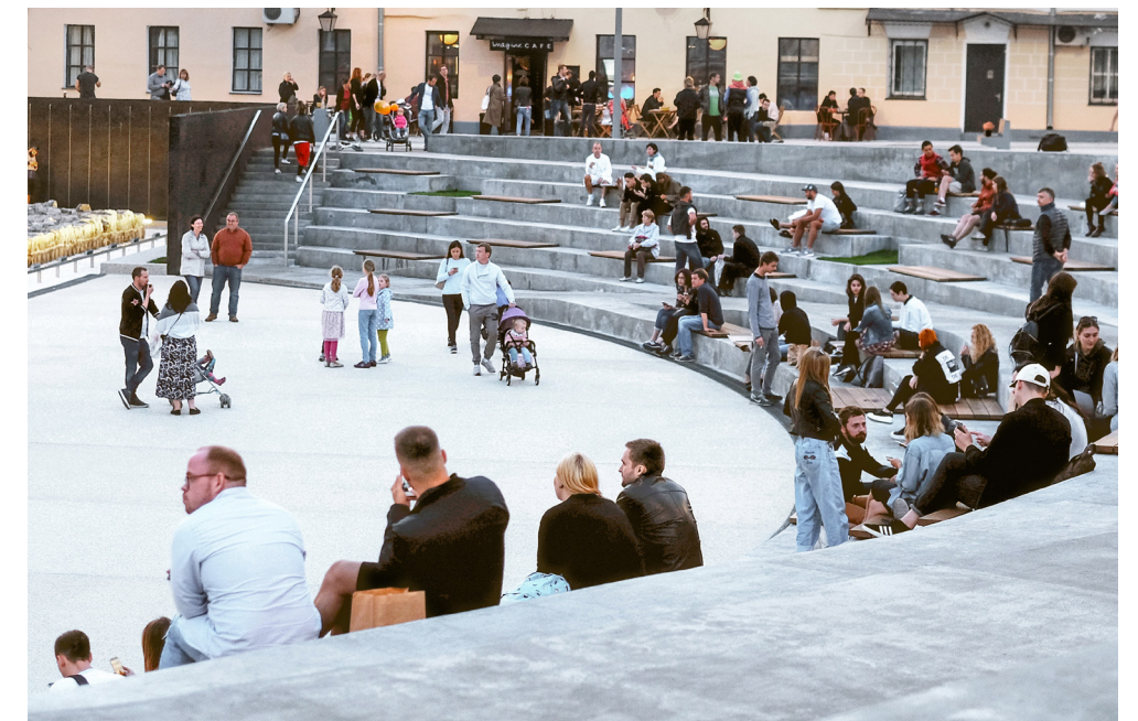
New leisure space to have lunch or hang out