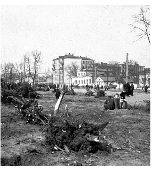
All gardens are cut down during the grand renovation of Moscow in the '30s