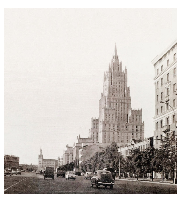
Lanes of trees are planted on both sides of the street