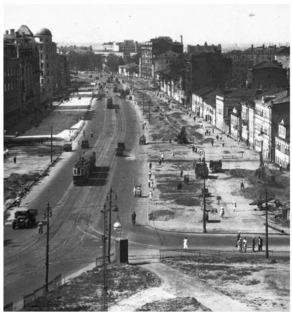
All gardens are cut down during the grand renovation of Moscow in the '30s