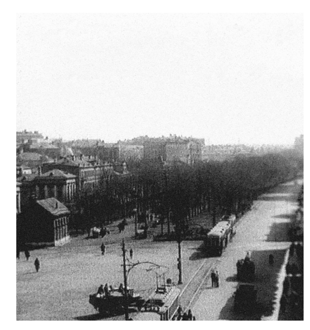
In the early 20th century, all residents are allowed to plant front gardens, turning the street into a true Garden Ring