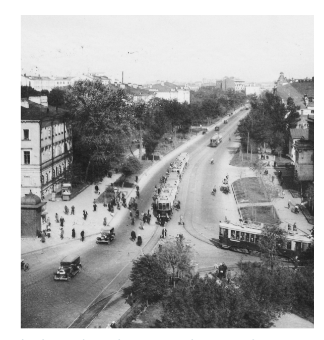
In the early 20th century, the street is a space framed with gardens