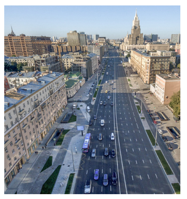
2017, before the new trees re planted. The street is refurbished under the "My Street" program. The road is limited to 10 lanes, sidewalks widened, greenery planted