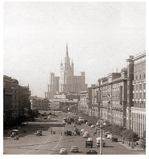
After the street is widened, tram lines are removed and small lanes of trees are planted alongside buildings