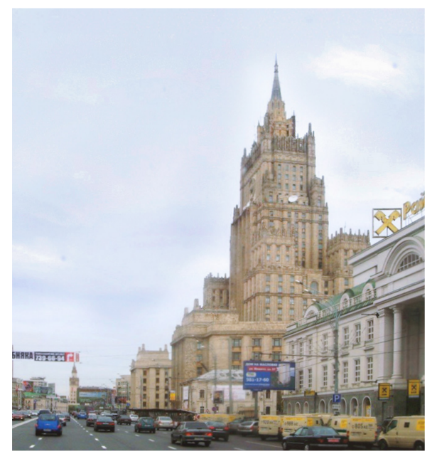
In the '90s, the Garden Ring becomes a busy highway with 14 car lanes and treeless, narrow sidewalks which are often used for parking