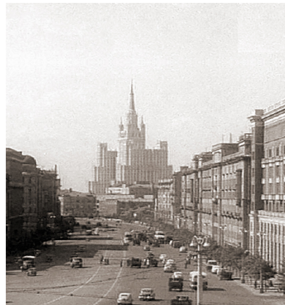
After the street is widened, tram lines are removed and small lanes of trees are planted alongside buildings