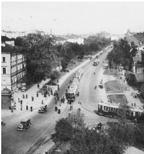
In the early 20th century, the street is a space framed with gardens