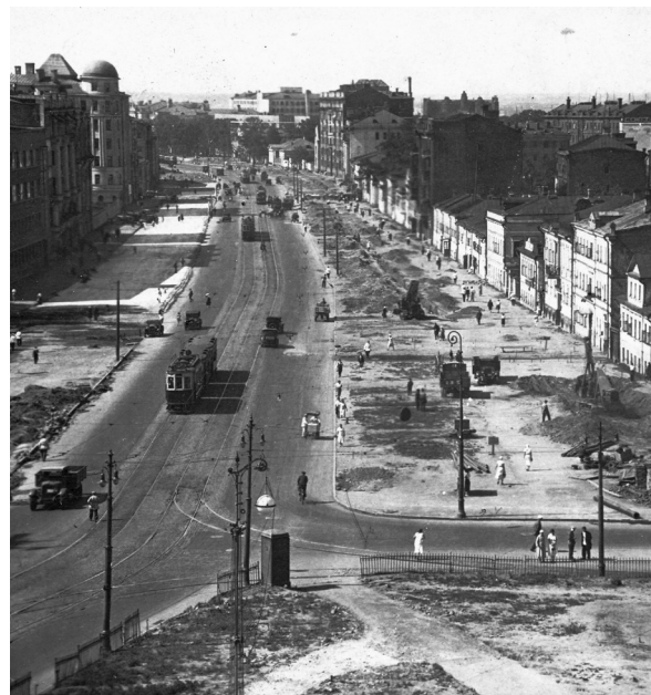
All gardens are cut down during the grand renovation of Moscow in the '30s