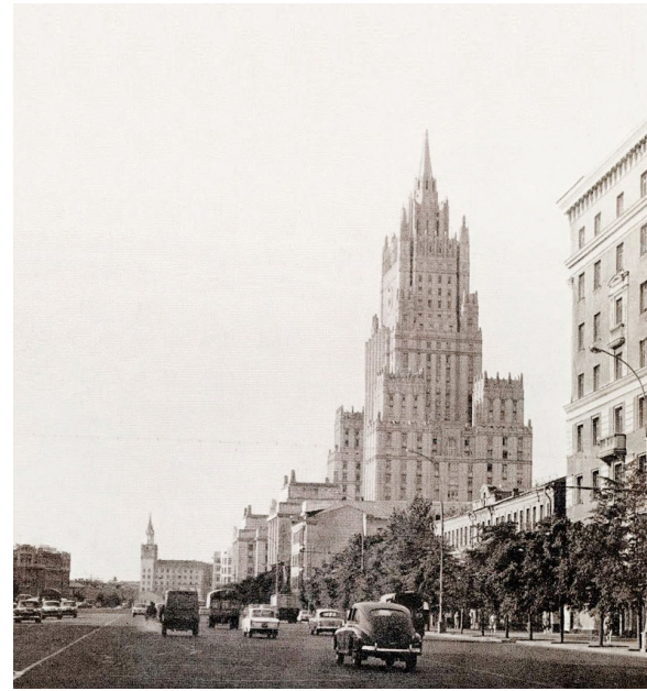
Lanes of trees are planted on both sides of the street