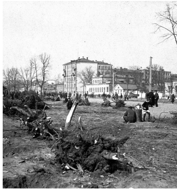
All gardens are cut down during the grand renovation of Moscow in the '30s