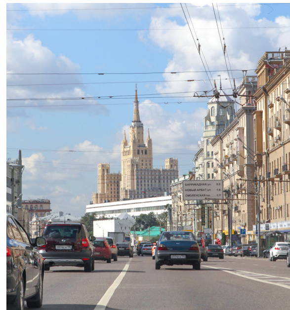
In the '90s, the Garden Ring becomes dominated by huge infrastructure due to aggressive development