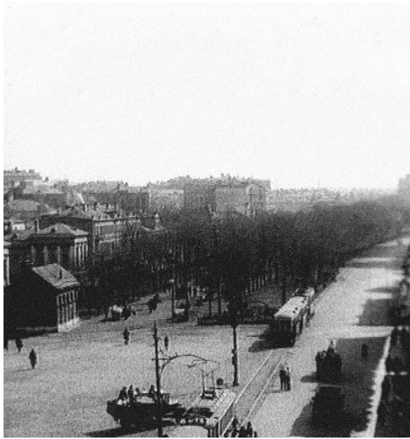
In the early 20th century, all residents are allowed to plant front gardens, turning the street into a true Garden Ring