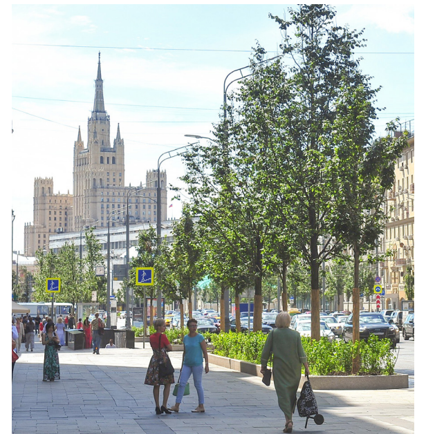
The street refurbishment brings gardens back to the Garden Ring