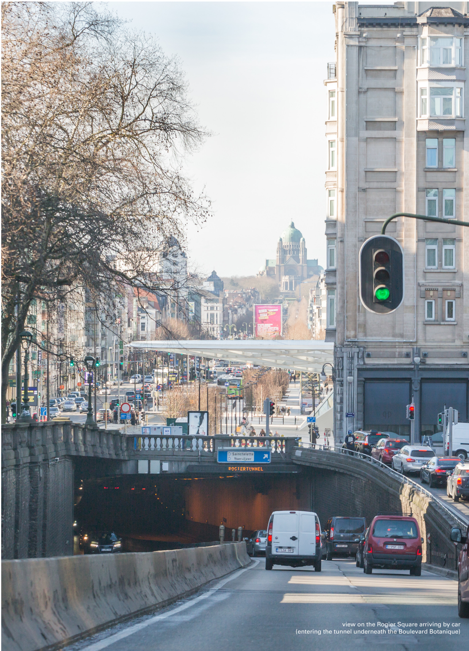
view on the Rogier Square arriving by car (entering the tunnel underneath the Boulevard Botanique)