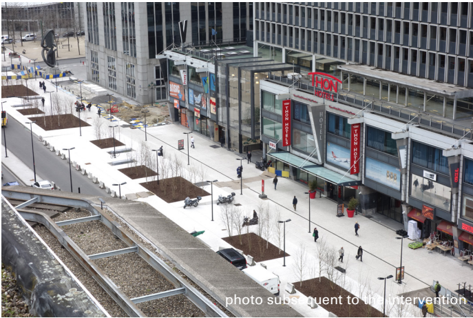
photo subsequent to the intervention