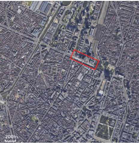
Aerial location map

XDGA's competition winning design for the Place Rogier in Brussels and its surroundings takes place on a number of levels. On the square itself, a generous patio is carefully excavated into the subterranean levels. The patio not only provides daylight to what are traditionally dark and artificially lit spaces but also acts as a connector, linking and facilitating the smooth interchange of passengers to and from street level to the intermodal transit hub. An enormous 64 metres diameter floating canopy covers not only the patio but also a bus stop, a significant portion of the square and even a part of the Brussels inner ring road. Together with the redesign of the square and its surrounding streets the project represents a daring new approach to the relationship between public space and public transport in the city.