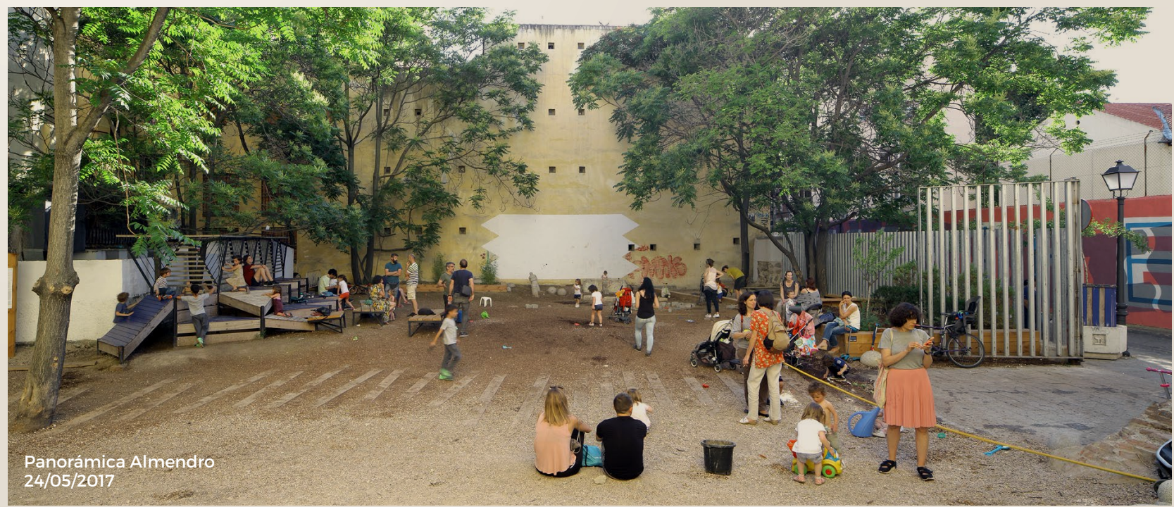
Panorámica Almendro 24/05/2017