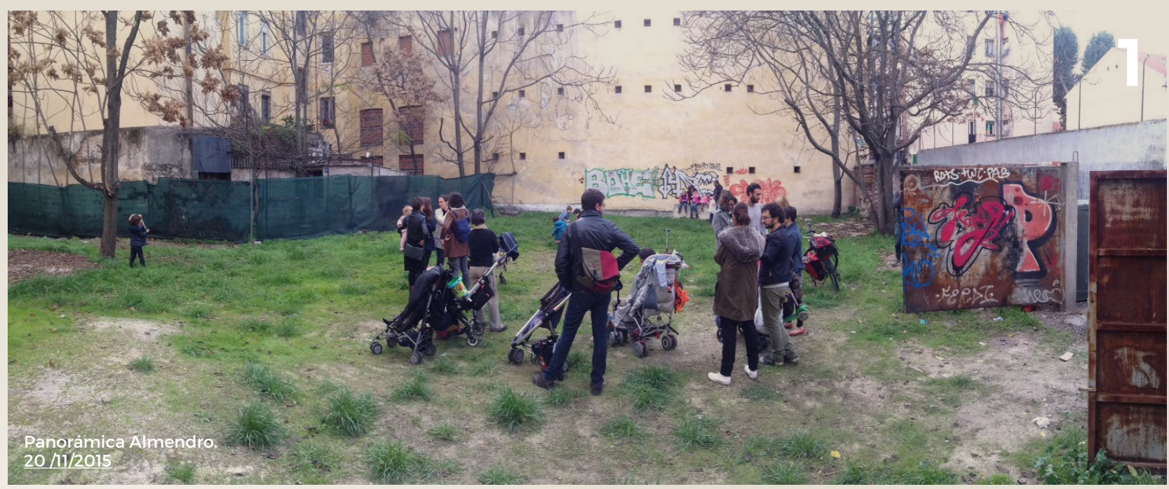
Panorámica Almendro. 20/11/2015