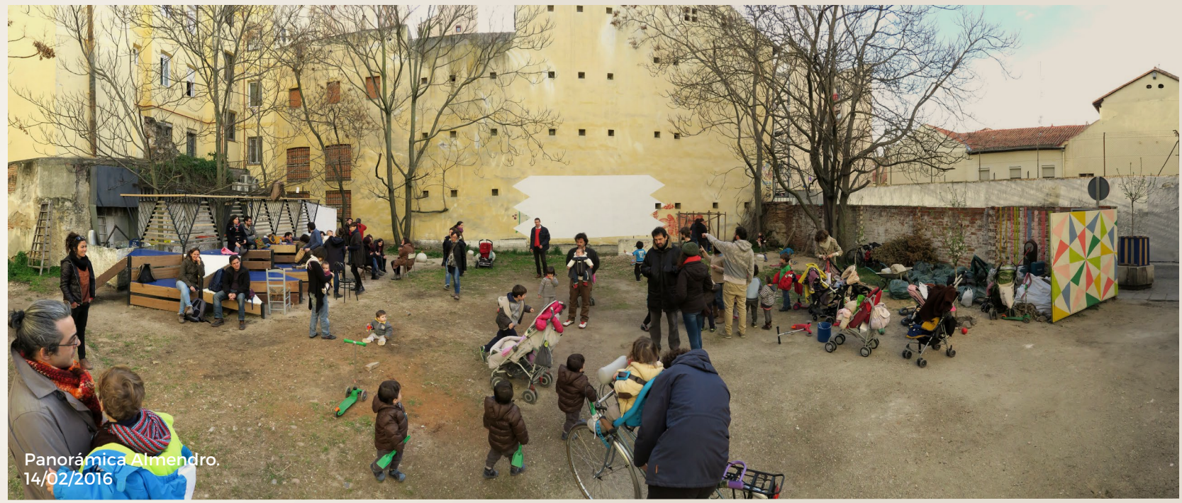
Panorámica Almendro. 14/02/2016

almendro3 is an historical garden, where underneath lies a christian wall that enclosed Madrid during the XI and XII century.