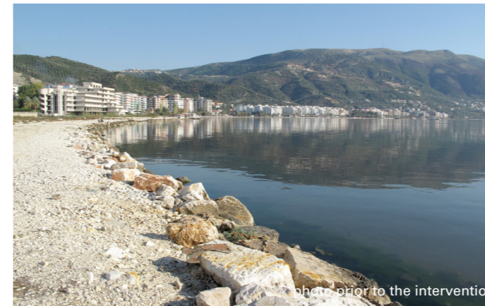
photo prior to the intervention