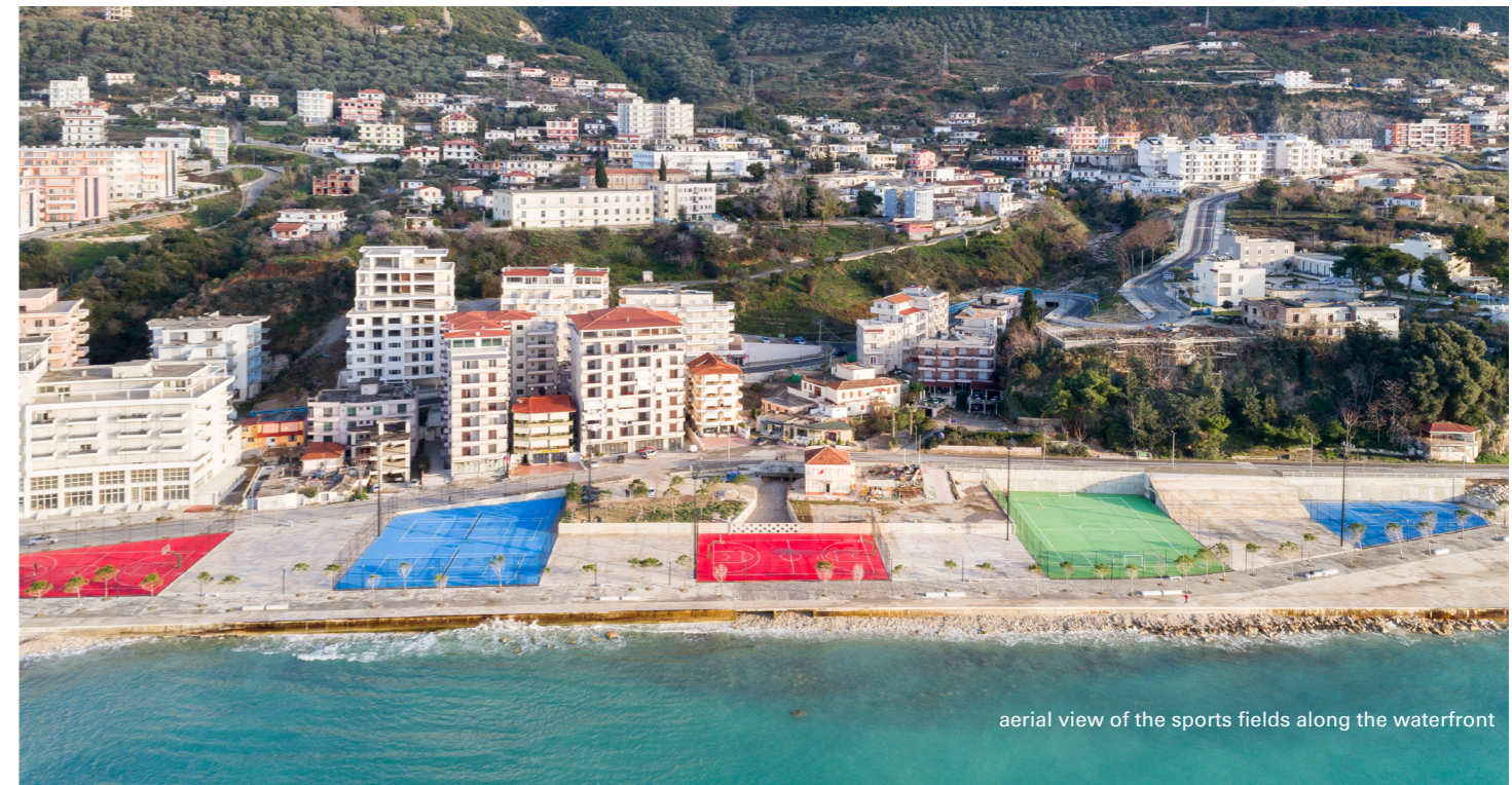
aerial view of the sports fields along the waterfront