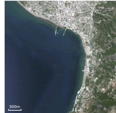
Aerial location map

This design proposal consists in a first phase of the logical extension of the existing boardwalk and broadening of the typical vegetation of Vlora. Extending the trees of Soda Woods over the full 5 km long coastline not only creates a harmonious whole, but also a unique and specific identity for the coastal town, typical of Albania's Mediterranean landscape. The 'Aleppo Pine', a pine native to the Mediterranean region, has a thin stem and a broad but flattened crown, thereby preserving the view onto the sea at all times and offering shade for all kinds of activities underneath the trees (sunbathing, sports, parking ...). In a later stage, certain areas can be tackled in a more focused way, for example through the creation of new white beach areas, sports grounds, swimming areas and water parks, a pier and a marina, new hotels, a floating island, ... This design proposal is open to interpretation and extremely flexible in sequencing and implementation: an instrument of urban intervention in the urban coastal area of Albania, in order to serve as a model.