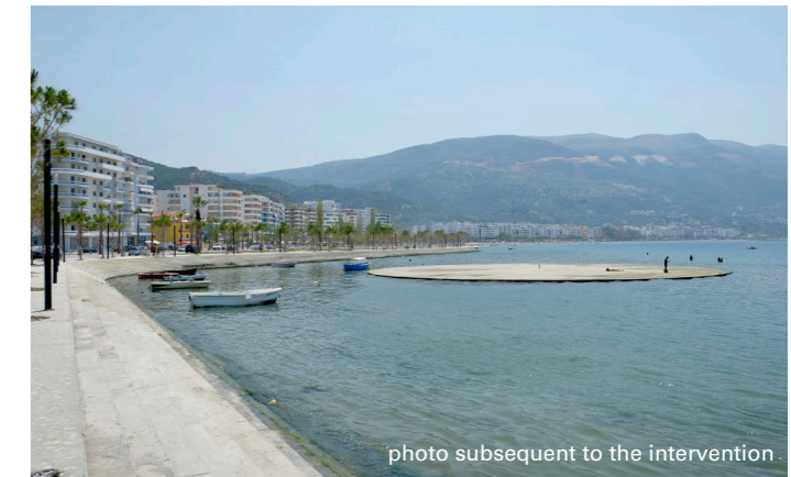
photo subsequent to the intervention