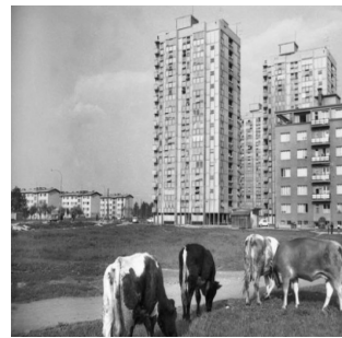
Neighbourhood in the 60s

The aim of a series of interventions was, put simply, to renovate the space. Because of unclear ownership and lack of municipal strategy, no direct funds were available for the regeneration of public space. The regeneration project had to cleverly seize the opportunities for small interventions that, by the end of 2016, resulted in one single renovated public space. Another aim was to solve the problem of maintenance by creating a public space that requires as little maintenance as possible. To overcome maintenance issues in the long term, a good relationship between the users and the space had to be established by involving the users in the intervention process. Children, as the most important present and future users, were the key actors in the participatory regeneration process that lasted for three years.