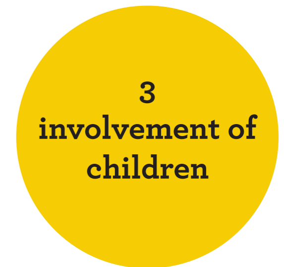
Three pillars of “Superhill” regeneration process