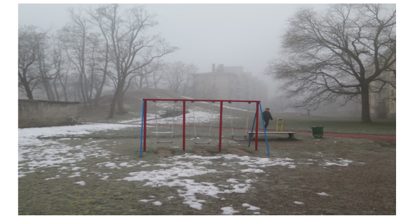
Playground, lawn and hill in the background