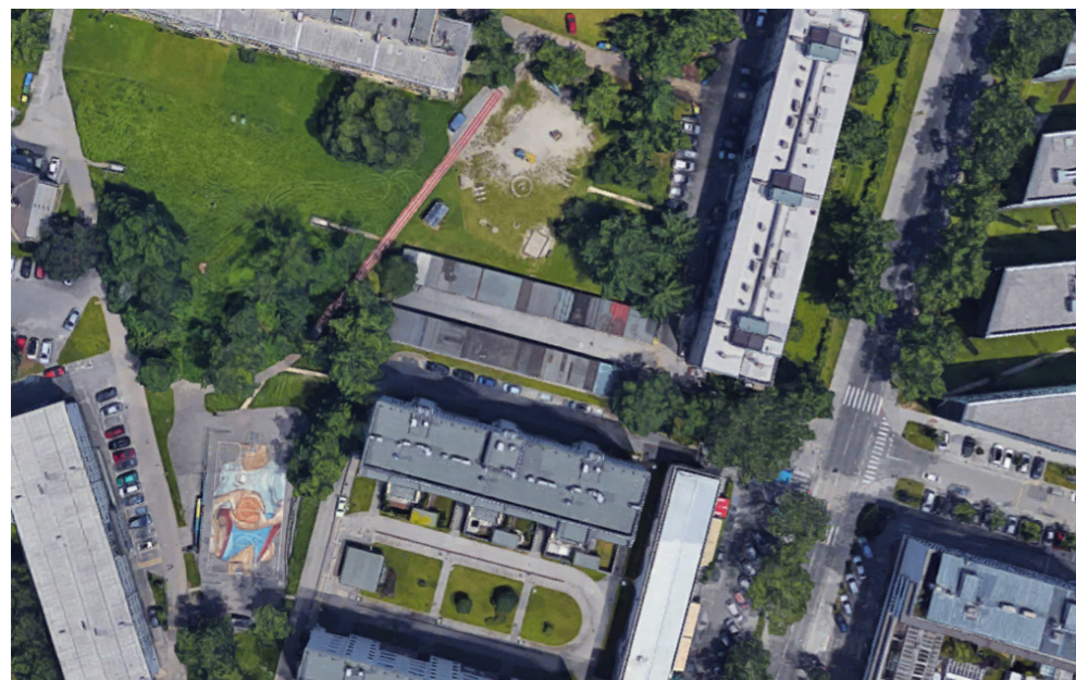
One public space, several owners