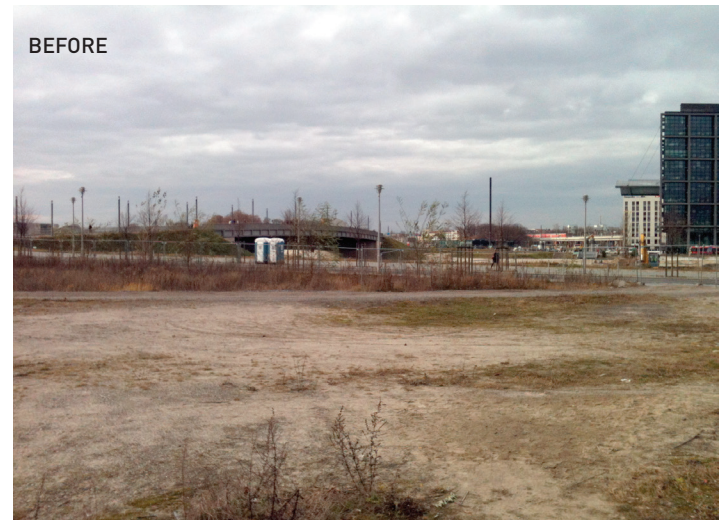
Site photo 2012