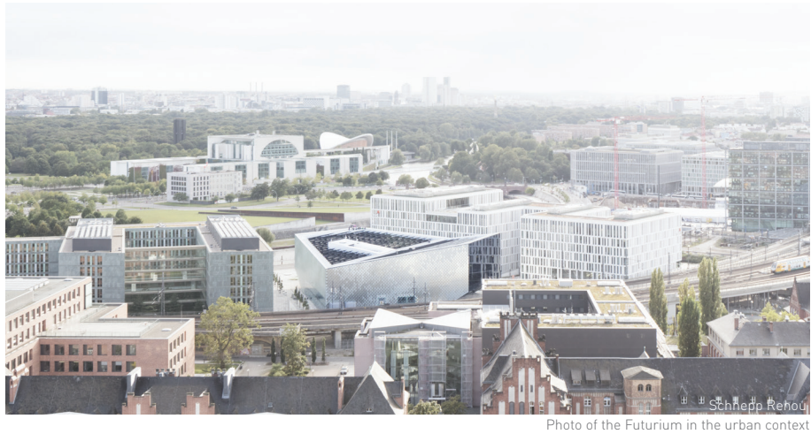
Photo of the Futurium in the urban context