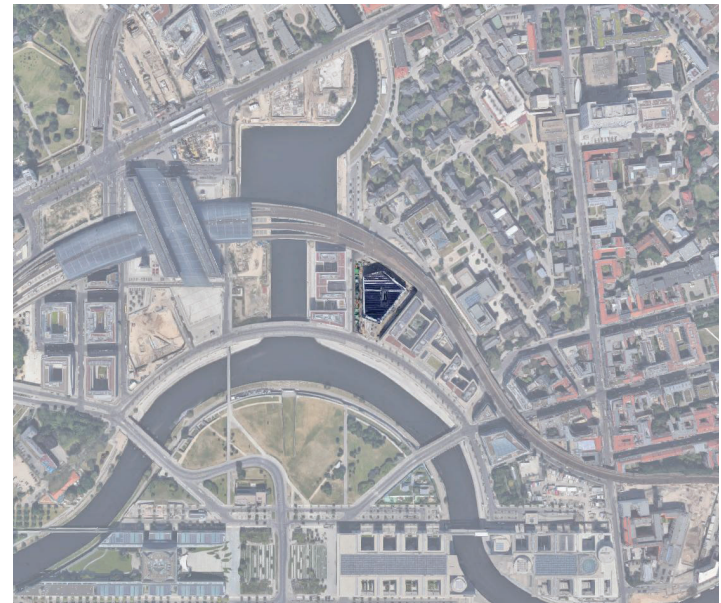
Site plan 1:10000

In 1990, after the demolition of the Berlin wall, the area became part of the urban development project for the new government district, but the connection to Berlin's city life was missing. The plot itself was an empty field, cut off between the river Spree, the elevated railway tracks and the adjacent office buildings still under construction. There was no sign of any public or inviting space for people to get together and meet.