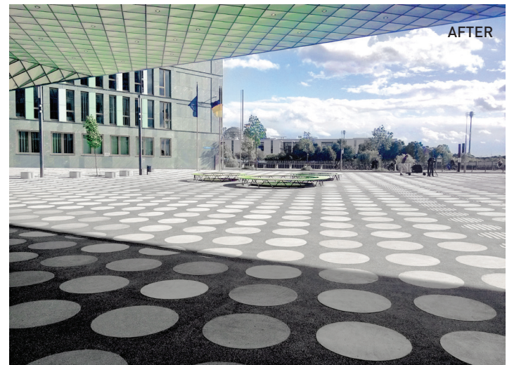
Site photo 2017