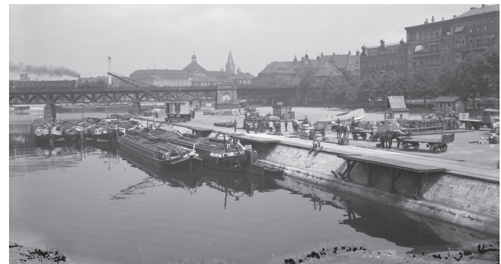
Site photo 1930