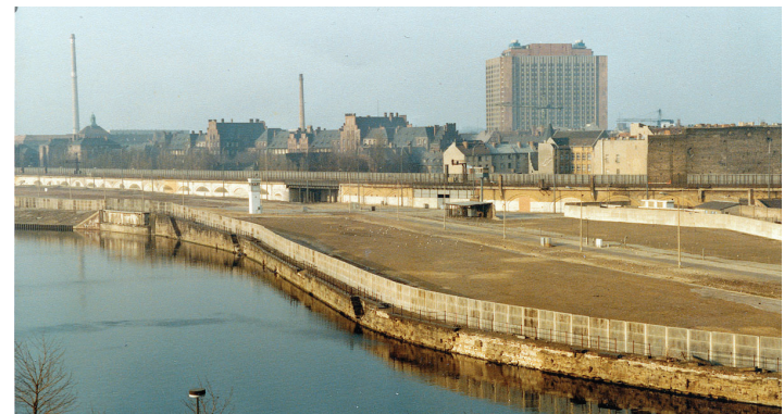
Site photo during the GDR- Berlin Wall