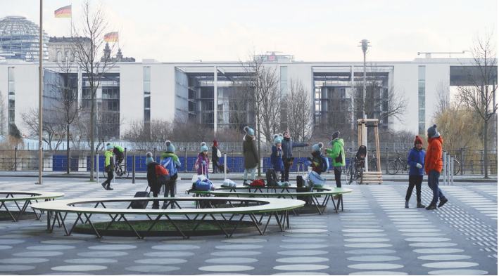
Kids taking a break on the circular benches