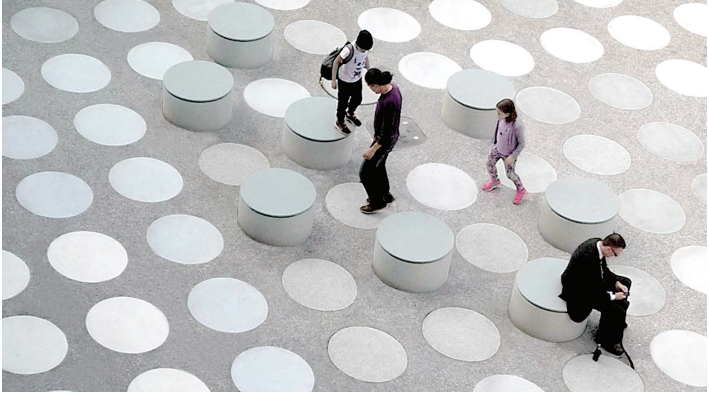
Dots as seating option