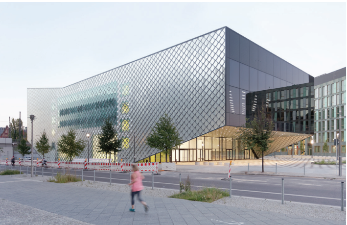
Photo of the entire building