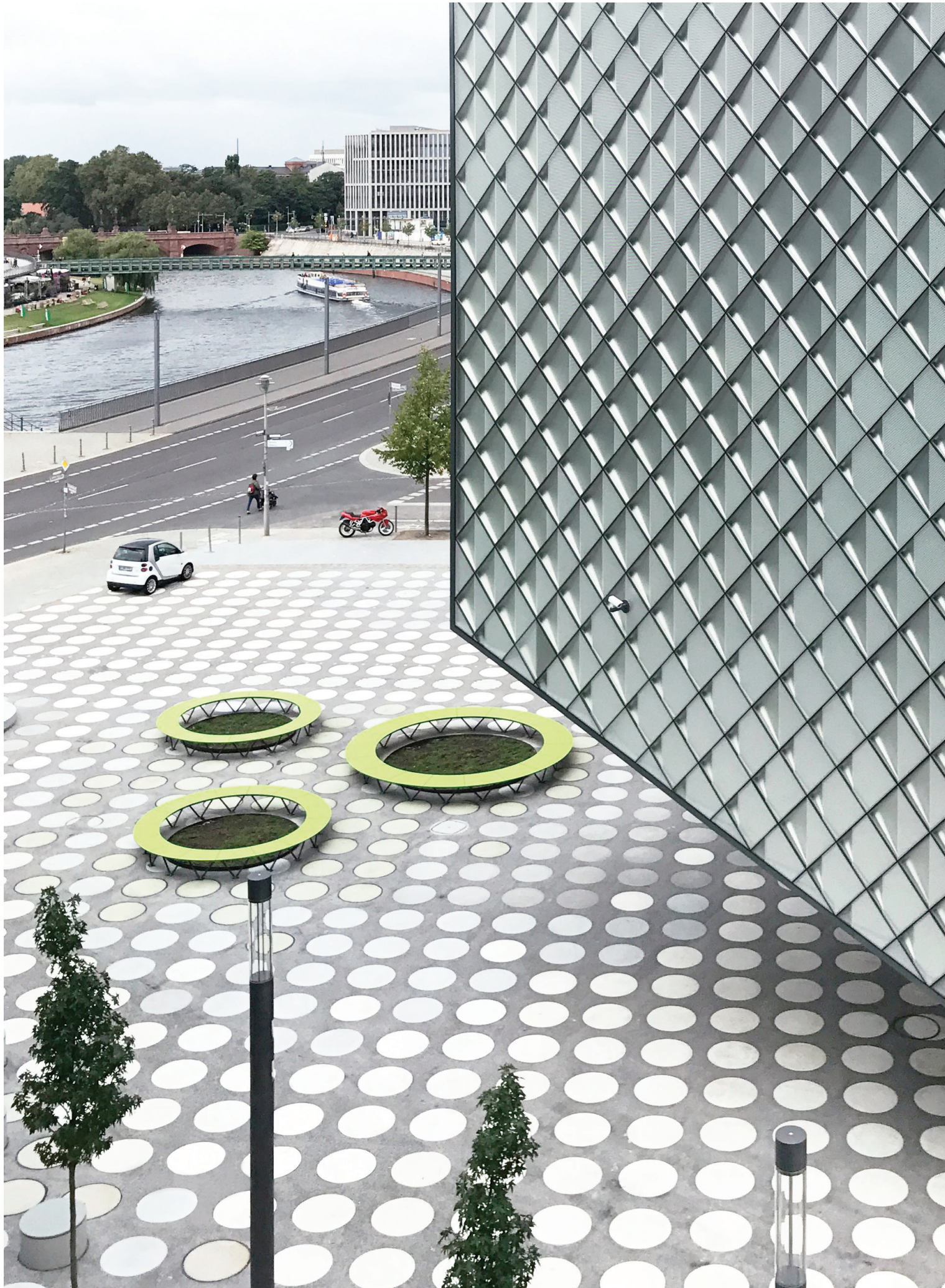
Square on the South