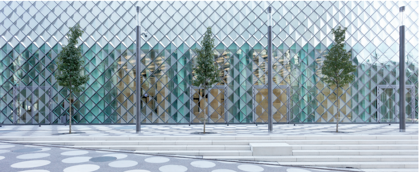
Passageway with amber trees and terrace for the event room