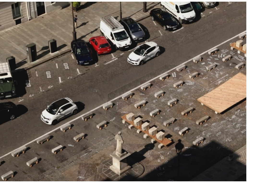
Parallel to the construction, a symbolic event took place to highlight the place of women in society in general, and public space in particular. Only 4 women (out of 80 people) are burried in the «Great Men of the Nation» monument.