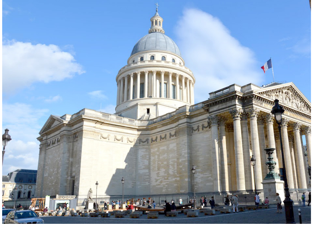
Last day of the two-weeks long construction workshop (july 2017)