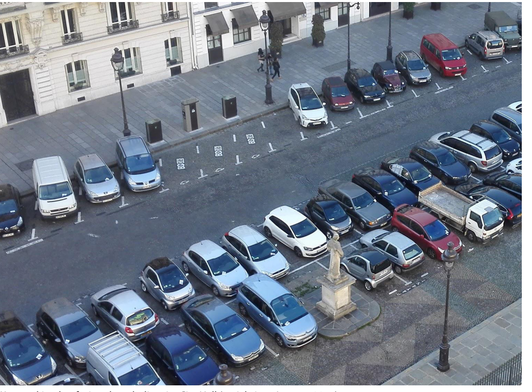
West parking lot, facing the 5th disctrict City Hall (aerial view, January 2017)