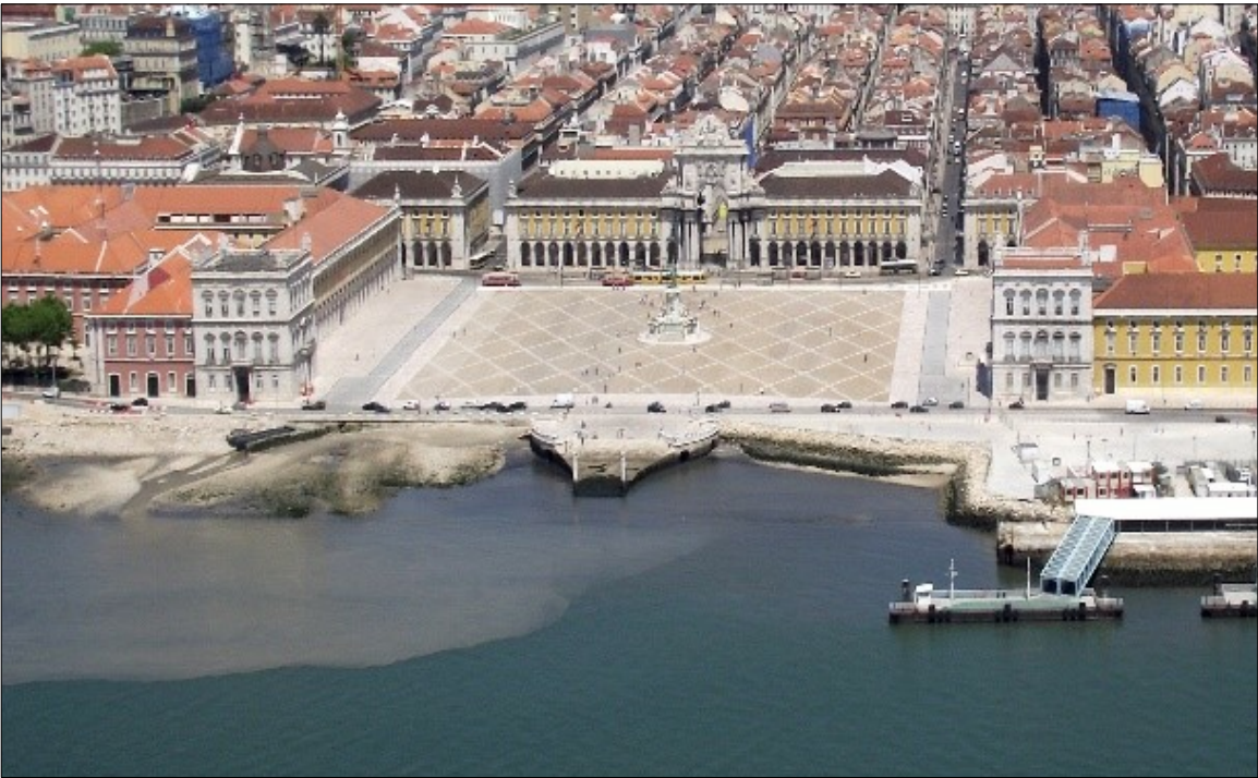
Scene in 2010