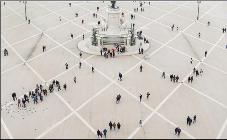
Scene in 2017