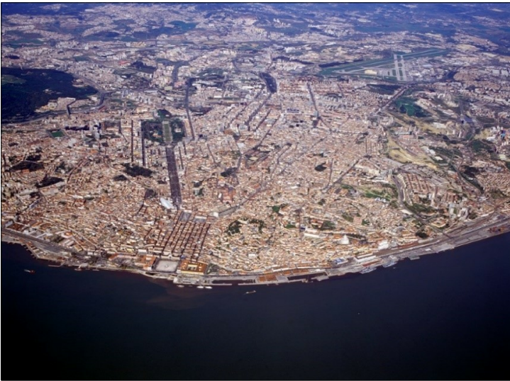
Aerial view of Lisbon, in front of the river