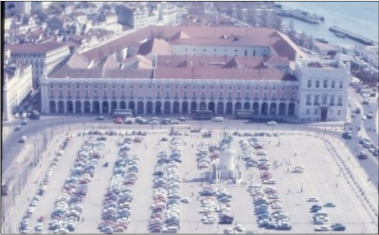
Scene in 1972