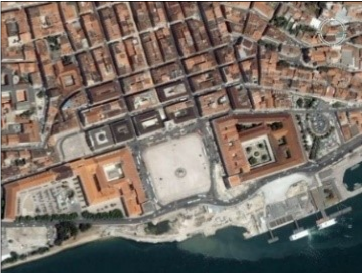
Praça do Comércio, 2008

At the beginning of the 20th century, the Praça do Comércio was acknowledged as the area depicting Portugal's Political Power and its Colonial Empire.