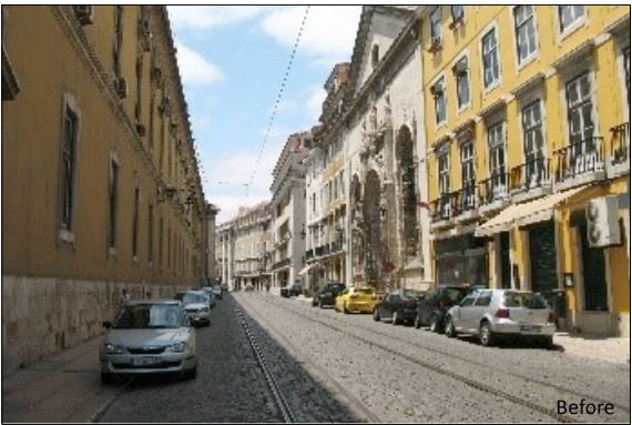
Rua da Alfândega