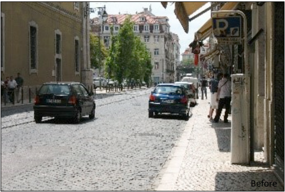
Rua do Arsenal