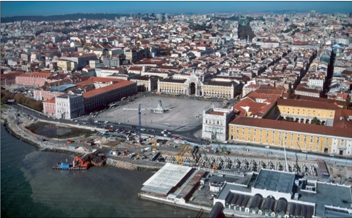
Scene in 2005