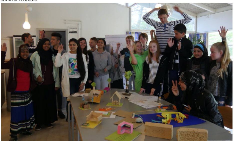
Pupils from the local Charlotte School were part of the workshops behind The Charlotte Bench.