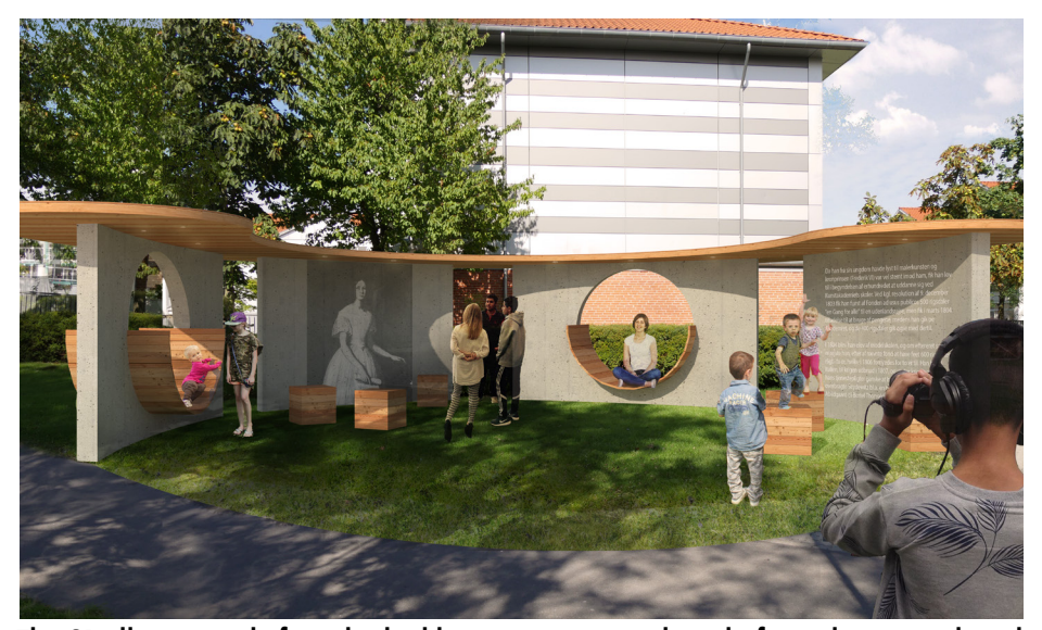
The 3D illustration before the building process started made from the original card board model.