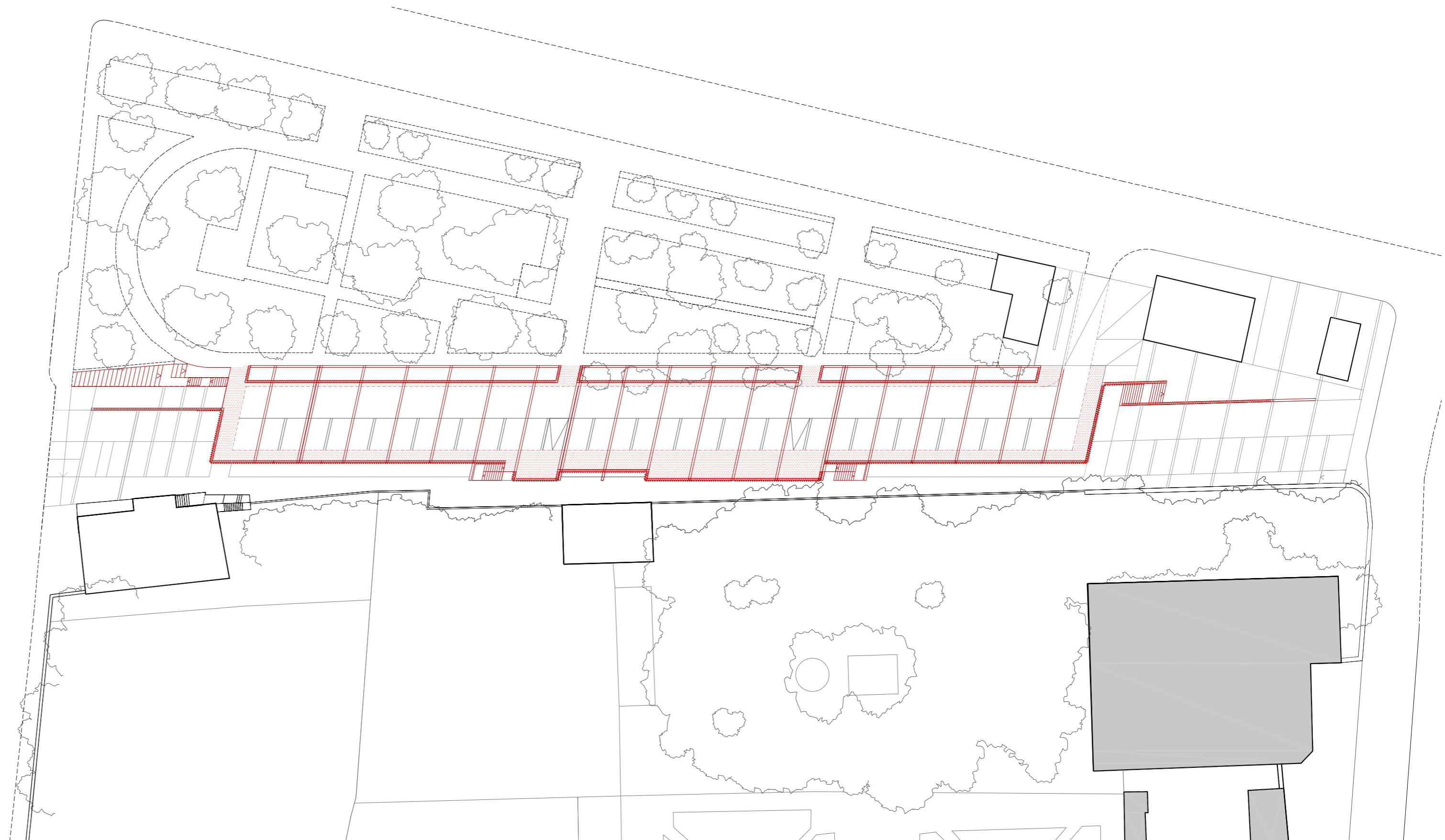
RENOVATION PLAN - FIRST FLOOR

The dual nature of the space is also showed in the uses. Firstly, the double Street works as a continuous circulation space and as a two-storey parking. So to speak, this could be the use on weekdays. Secondly, the cross section transmutes to a "Double Space" and opens possibilities for other uses such as public and social events. All these lounge and public uses, can now have a major role of the double street dedicated to the judge Falcone. In other words, this optimistic mutation of the public space opens new dormant possibilities.