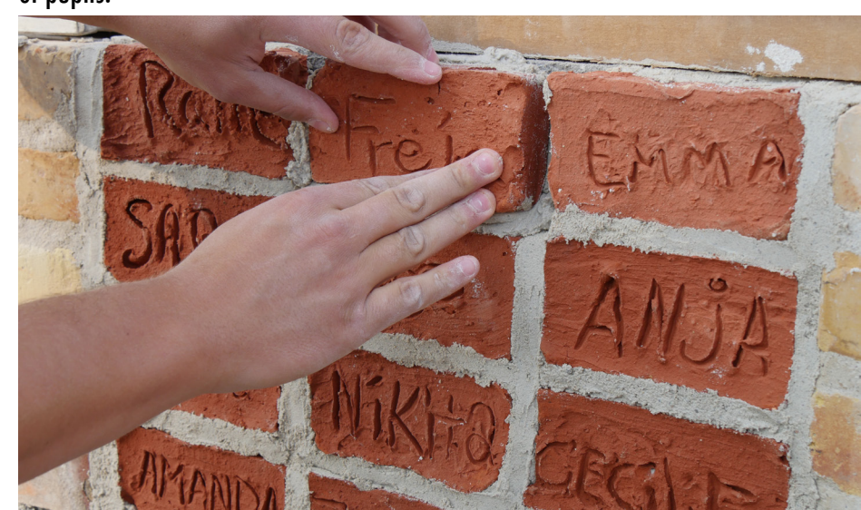
The bench is being built by masons assisted by the residents. Here the bricks with the names engraved are being placed as part of the bench.