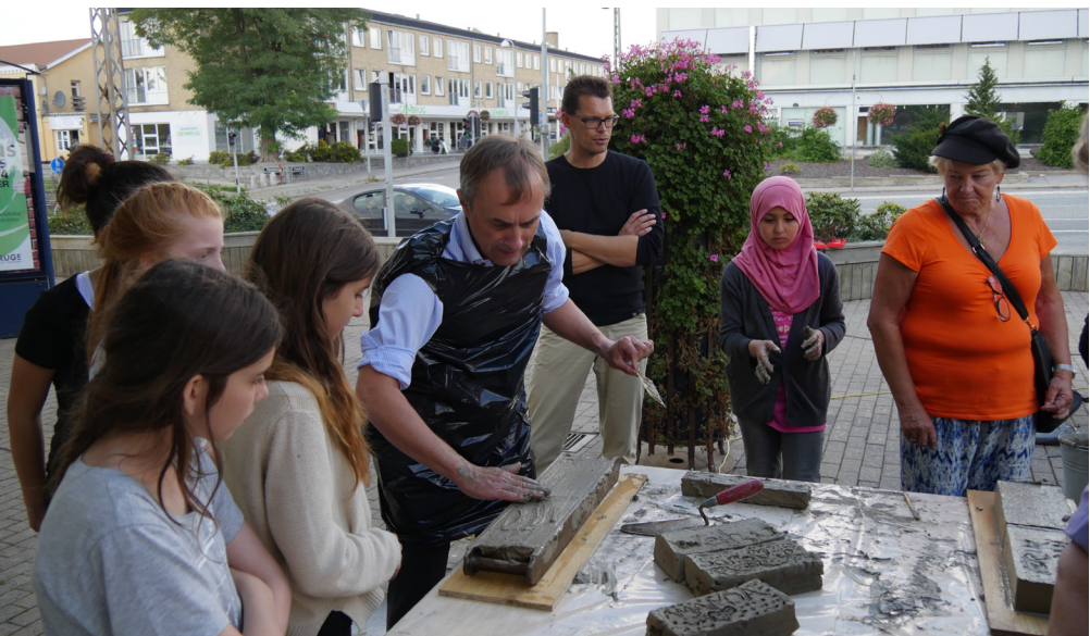
Pupils from The Charlotte School show the Mayor how to make bricks and help him engrave his name in the clay.