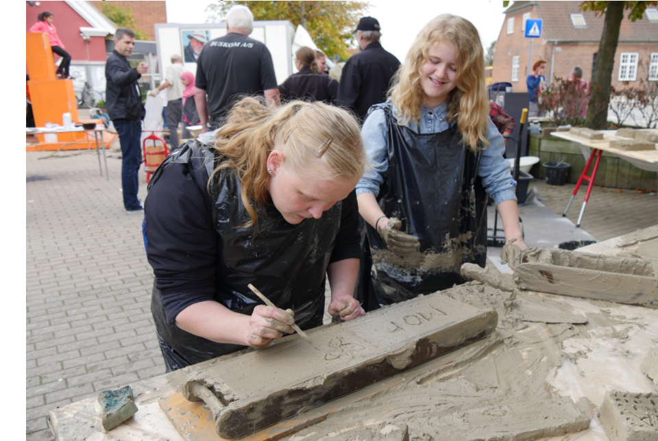
Engraving names in the bricks.