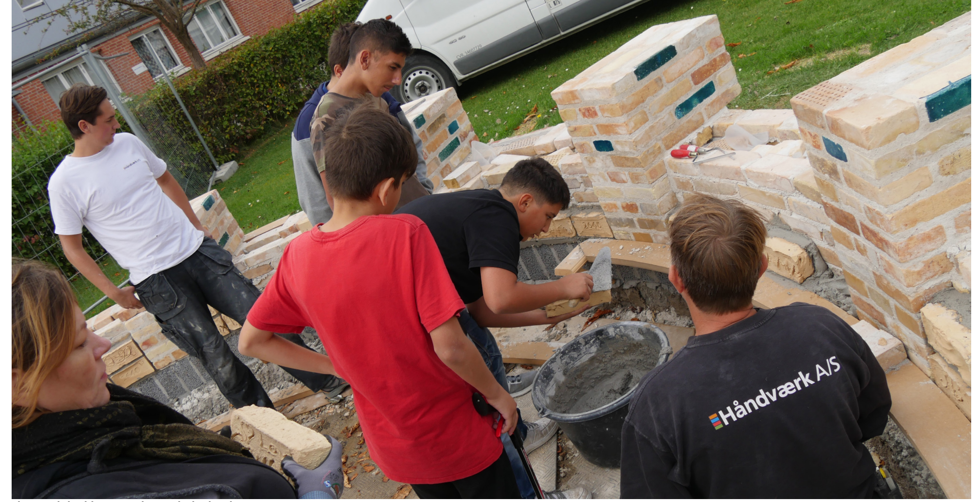
The youth building together with the local mason

The Brick Bench was designed and built by the residents of the social housing area. But before the bench itself residents created their own bricks in a public workshop to honour the local history of the brick industry. From the ideas of the residents a professional drawing was made and local businesses and craftsmen were involved in order to bridge the gap between the town and the social housing area.