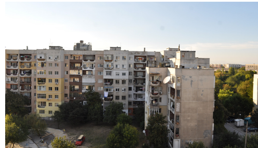
Trakiya neighbourhood.

Under the motto ACTION! Towards a neighbourhood practice , three architecture collectives were invited to do different interventions in an underused public space located between the three initial residential blocks.