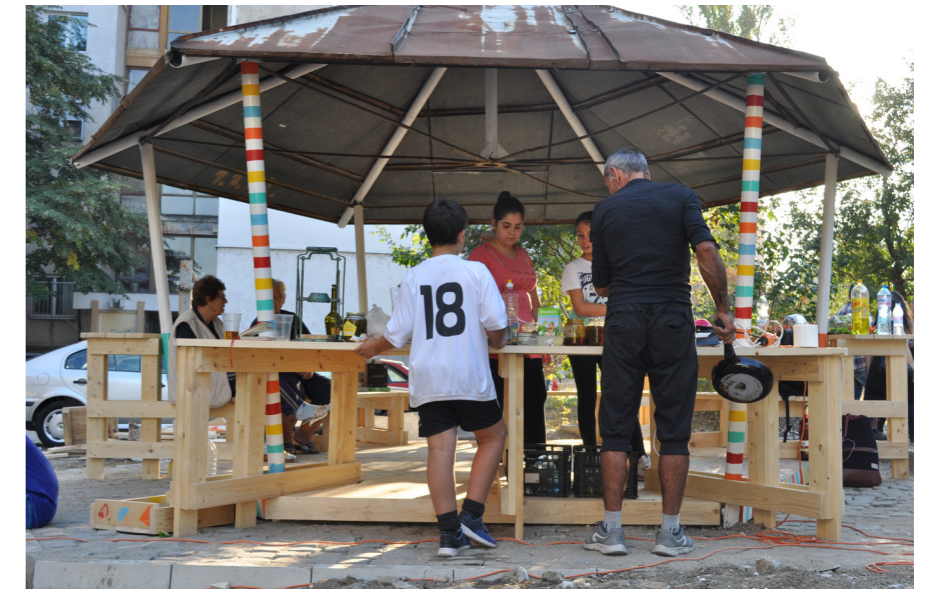
Kiosk during our last day of intervention.

The Jammin' kiosk provided a shared space to make confiture, to gather, to improvise and to converse, similarly to what happens during musical jamming sessions. Through activities set as a series of "jamming sessions", the initial kiosk was transformed whilst giving place for narratives around the common use of the space by different groups of neighbours to be shared.