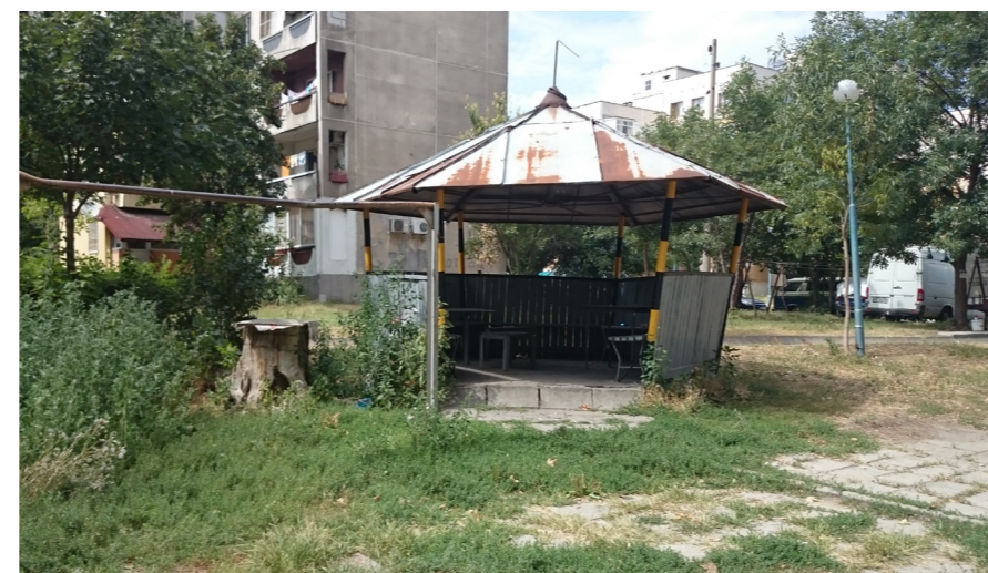
The kiosk in its original state.