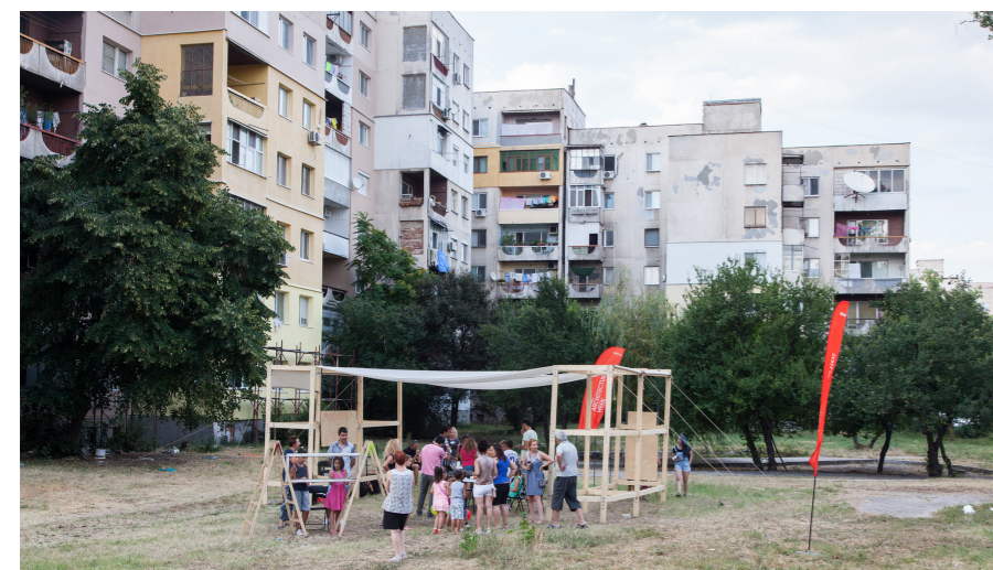
|In|Formal team during a session with the neighbours.