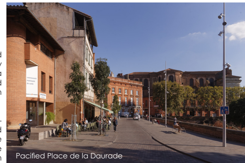
Pacified Place de la Daurade