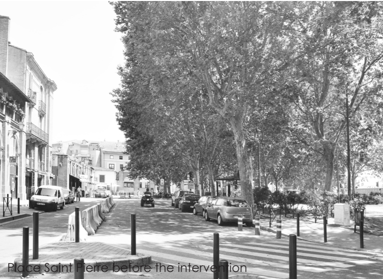
Place Saint Pierre before the intervention

For the upper level of the plaza a unified and continuous mineral (porphyre) surface was chosen, with a contemporary visual impact. It also welcomes new trees planted in groups that contrast with the double alignment of the great old plane trees.