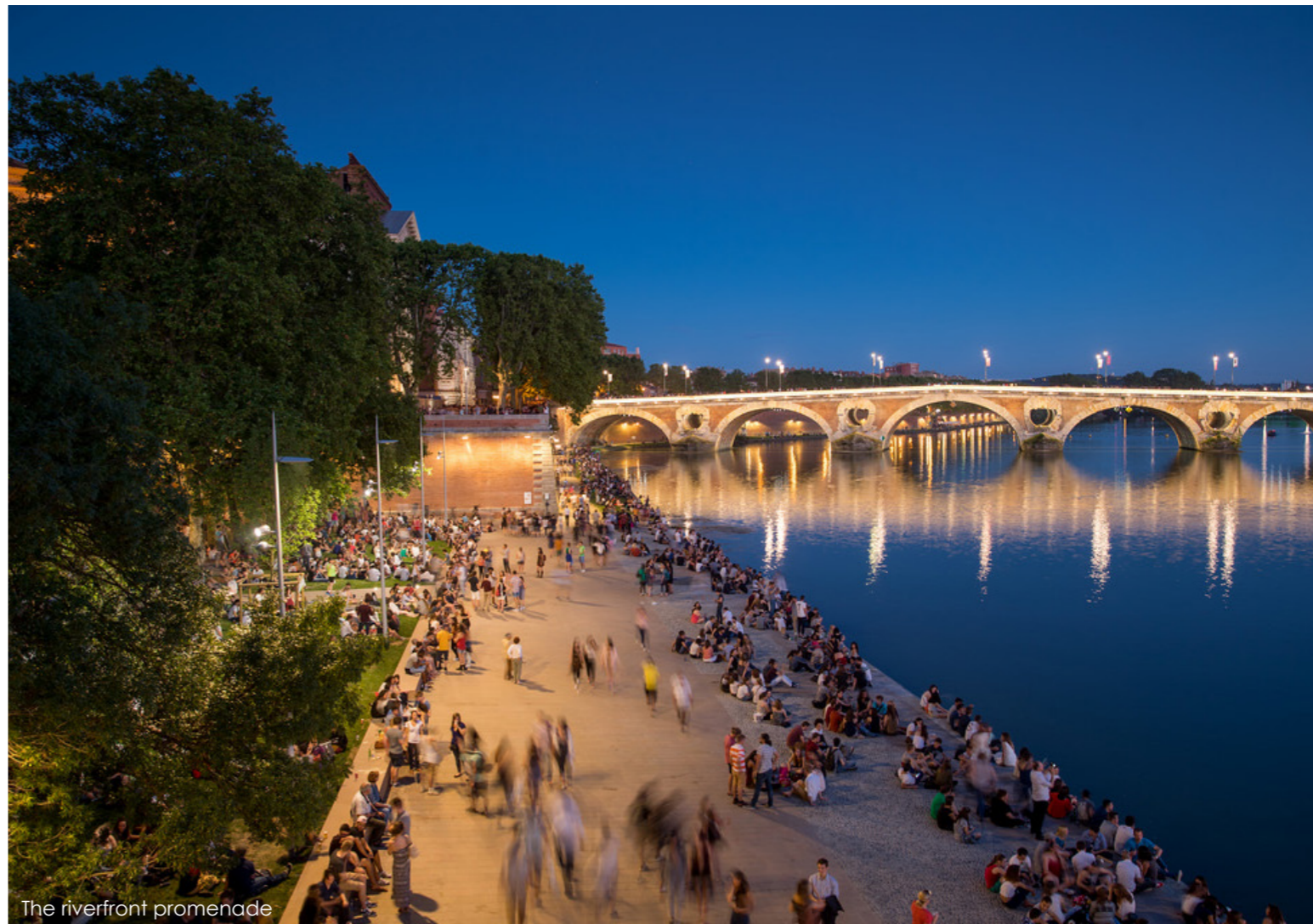
The riverfront promenade