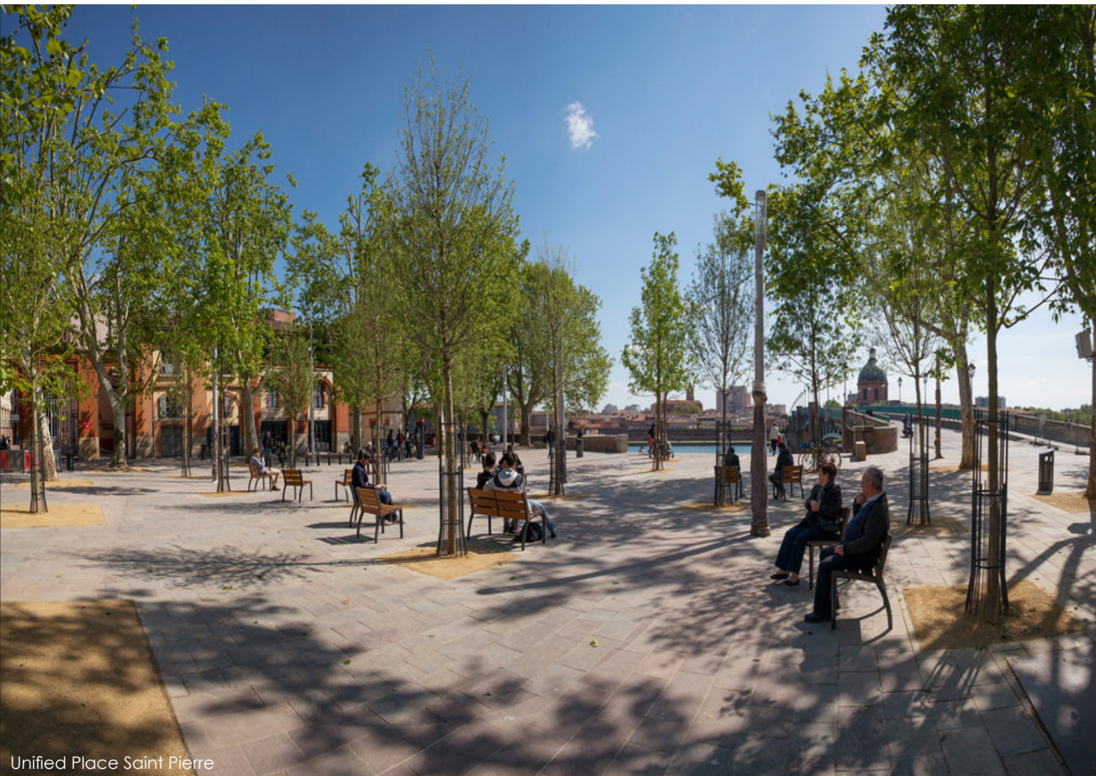
Unified Place Saint Pierre