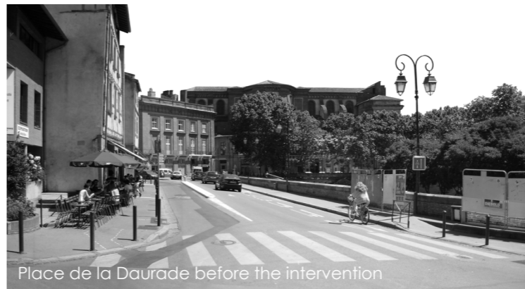
Place de la Daurade before the intervention

The Restoration of the monumental walls was executed with the traditional Toulousan Brique Foraine (60x28x5 cm) and lime mortars.