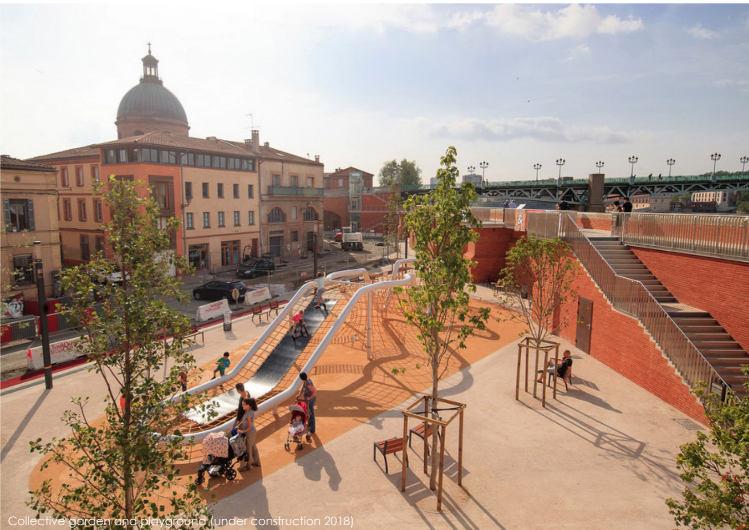
Collective garden and playground (under construction 2018)