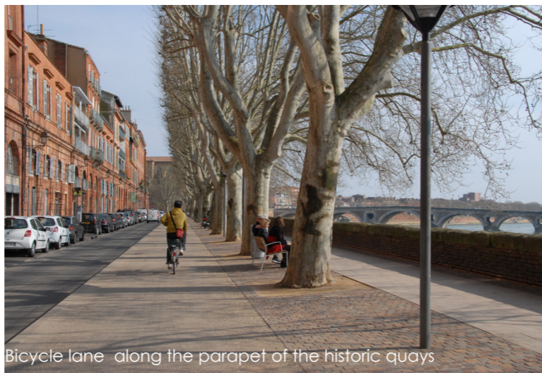
Bicycle lane along the parapet of the historic quays