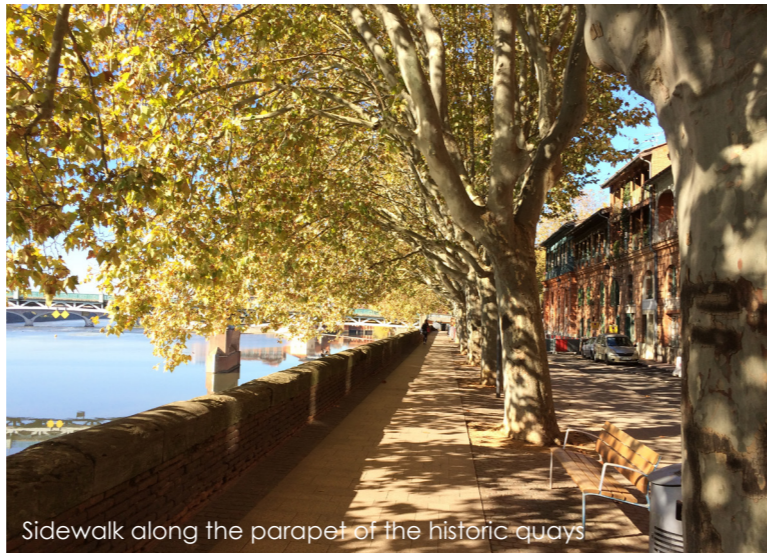
Sidewalk along the parapet of the historic quays