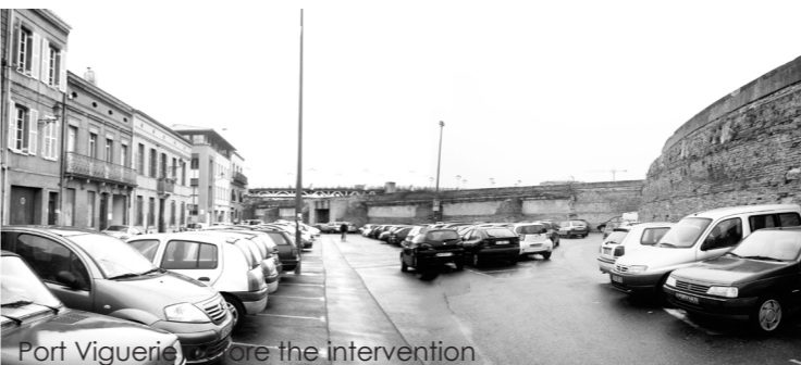
Port Viguerie before the intervention

The development of the port Viguerie will make this place a link between the historic ports of the right bank of the Garonne and the architectural heritage of the Saint-Cyprien district, between the Hotel-Dieu and La Grave. On the monumental brick wall a new belvedere is shaped connecting the port Viguerie with the bridge Saint Pierre and generating a complete new vantage point over the Garonne.