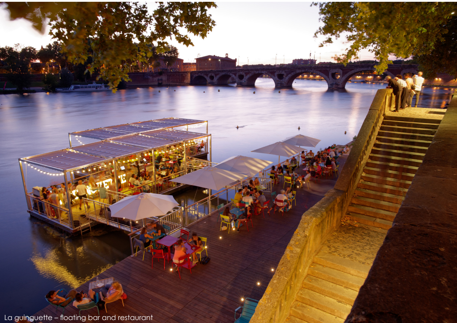
La guinguette - floating bar and restaurant