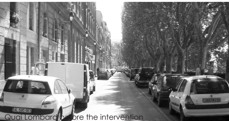
Quai Lombard before the intervention

The floating deck consists of a modular design that allows easy assembly, disassembly and storage. When the water level is high, the restaurant must be disassembled. Only certain elements such as the kitchen and toilets are fixed under the stairs of the quays Tounis.