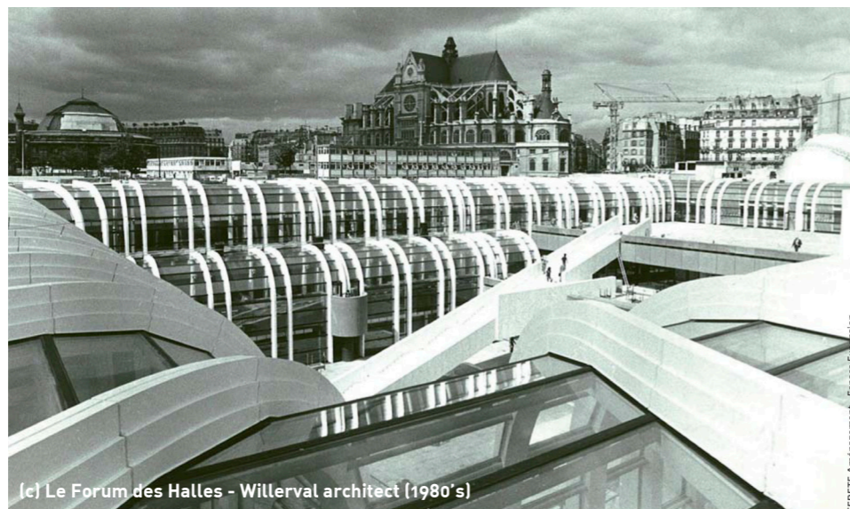
[c] Le Forum des Halles - Willerval architect (1980's)

Located in the heart of the city and built in the 1970's, the Forum des Halles is the largest underground complex open to the public ever constructed in Europe. Laid out over five basement levels, it groups together a multimodal public transport hub (800 000 visitors/day), a leading shopping centre, public cultural and leisure amenities as well as sports facilities. An underground road network and several car parks lie within its perimeter.