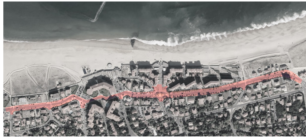
50 m Satellite view before after