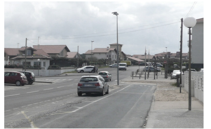
The «boulevard de la Dune» before after