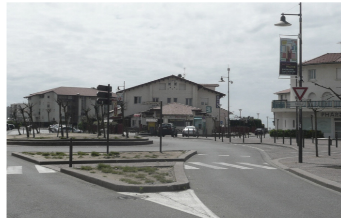
The «place des Basques» before after