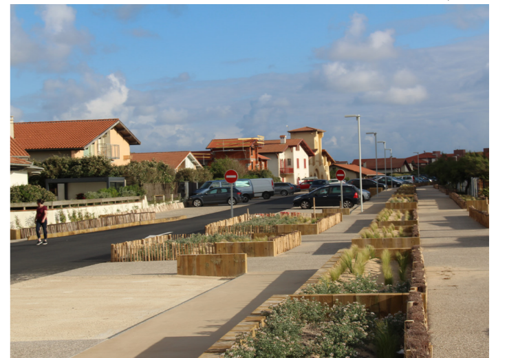
Copyright © «D'une Ville à l'autre ...»