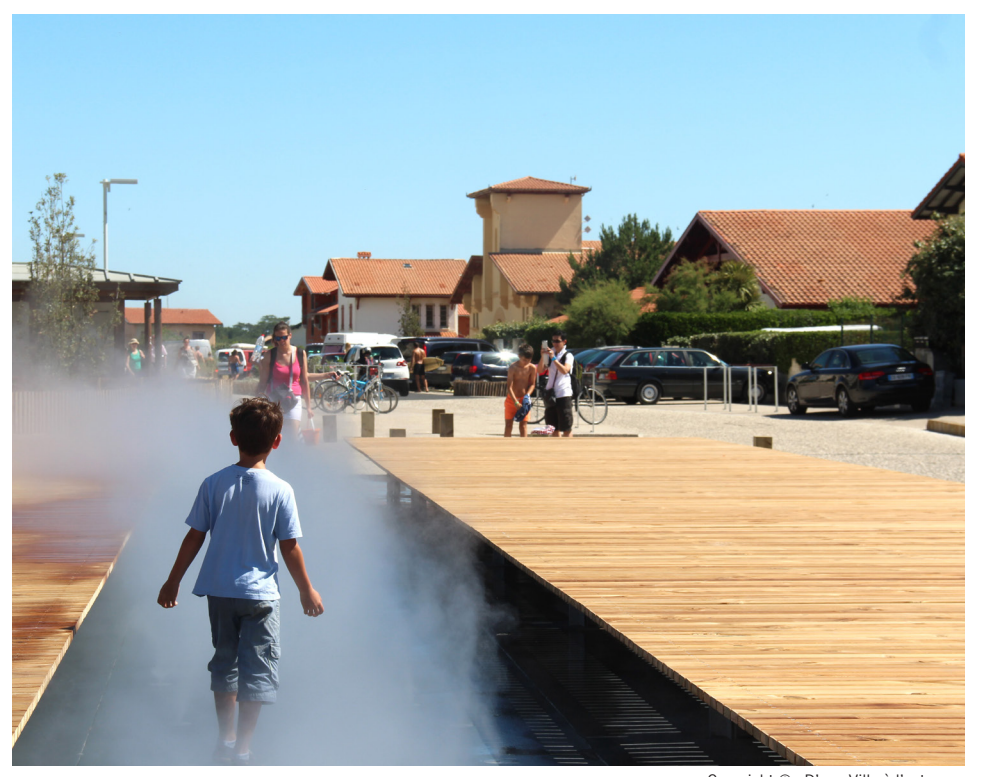
Copyright © «D'une Ville à l'autre ...»