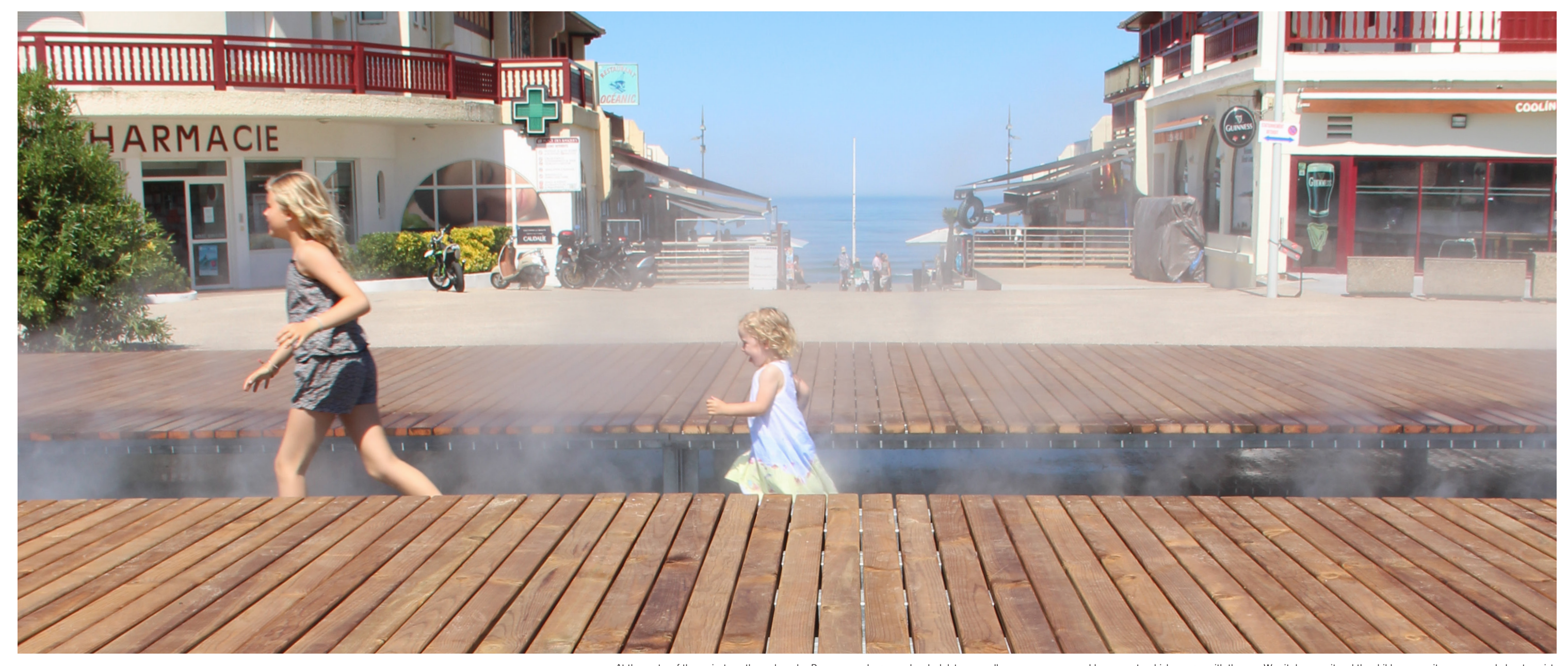
At the centre of the project, on the « place des Basques », a huge wooden deck lets you walk over sea spray, on a blue concrete which merges with the sea. We sit down on it and the children cross it over surrounded water mist.