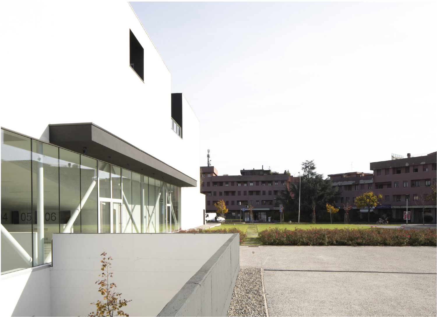
entrance of the music centre building