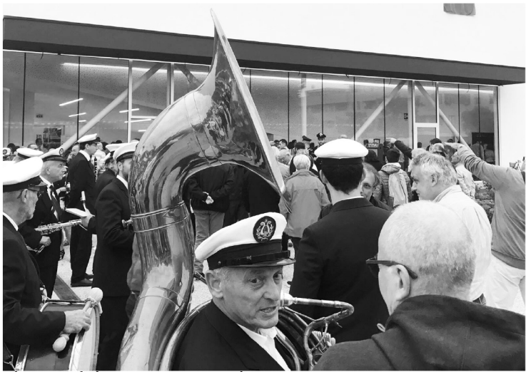
photos of the inauguration day

AIM OF THE INTERVENTION The urban paradigm has a key role in the project; the aim of the intervention is, in fact, to create a place for people and the community to meet and to feel at home. The Music Centre is going to be a cultural reference point for the city and its surroundings; for this reason, the indoor and outdoor areas of the Centre are designed as flexible spaces to welcome the widest audience possible. Furthermore, the complex program of activities and spaces of the Centre wants to let the building open, bringing urban life into the neighborhood all day long.