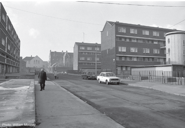
The Chamber Court flat complex, late 1970's.