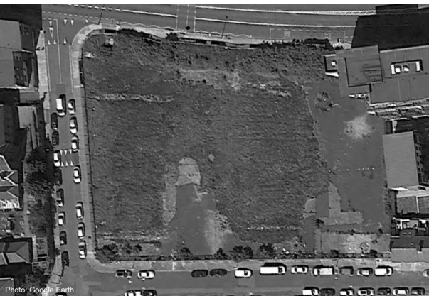
Aerial view of the site post demolition of the Chamber Court flats, circa 2010.