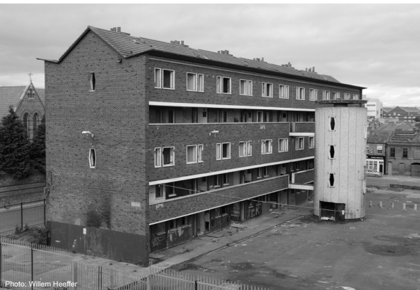
A view looking north west across Chamber Court, 2008.