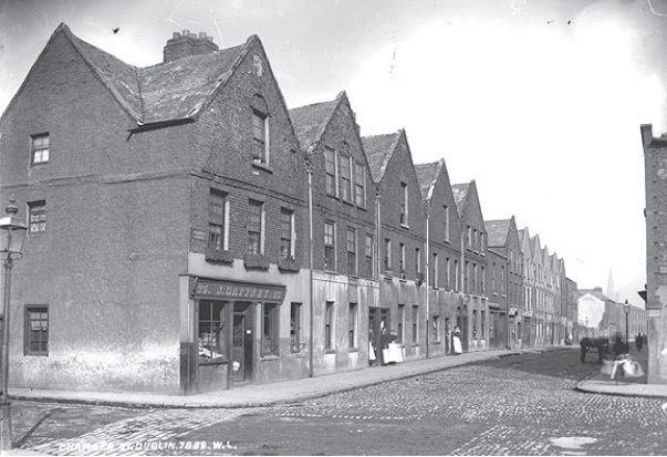
Photo of historical 'Dutch Billy' gable-fronted housing on Chamber Street.