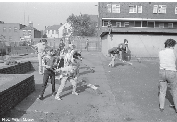
A community 'clean up' at the Chamber Court flats circa 1980's.