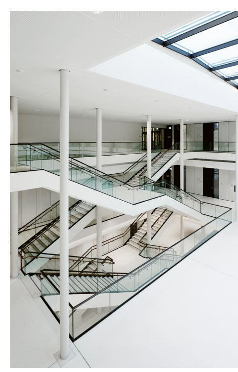
Stately – after the intervention the Niedersachsentreppe now shines in a new light.