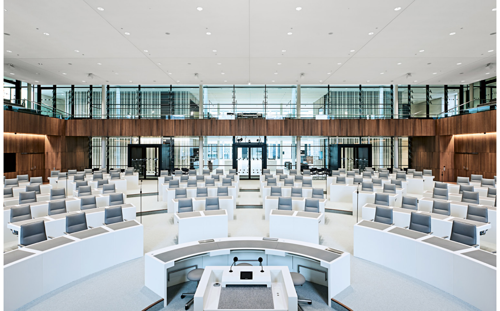
The State Parliament as a landmark of democracy – and a dignified space for political debate.