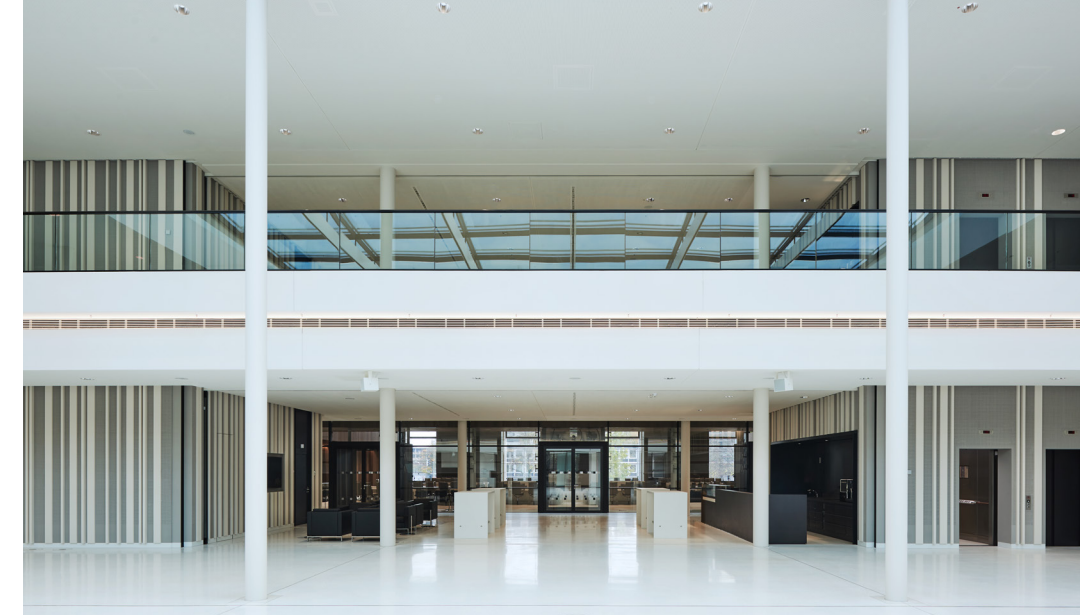
Stylish – the portico-fronted hall reflects the building's stately character in a new and modern guise.