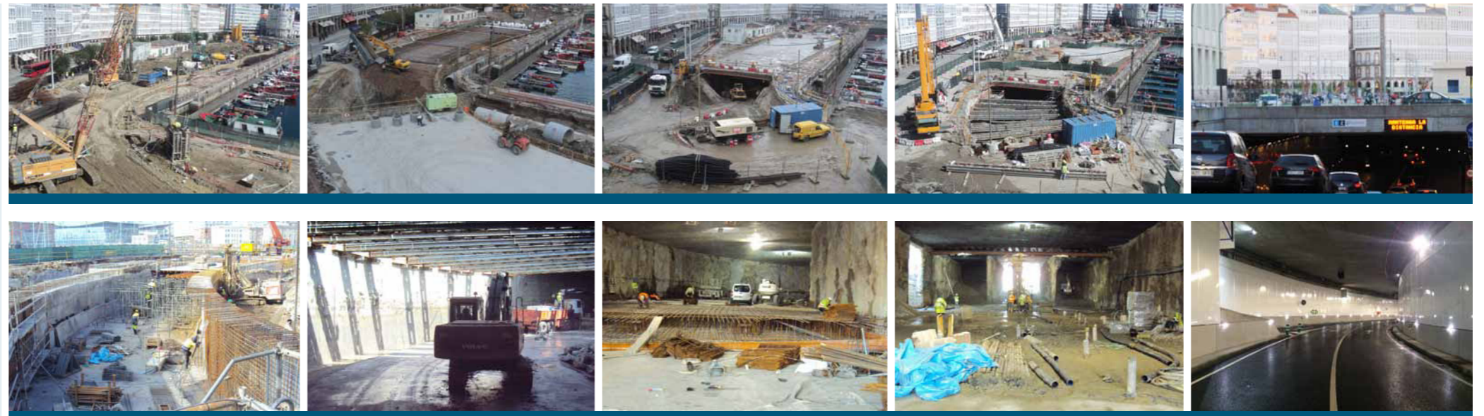
Progress of road tunnel construction works

Work execution was characterized by a high degree of technical complexity, due to the proximity to the sea, less than 2 metres in some cases, and also to the location of the site.