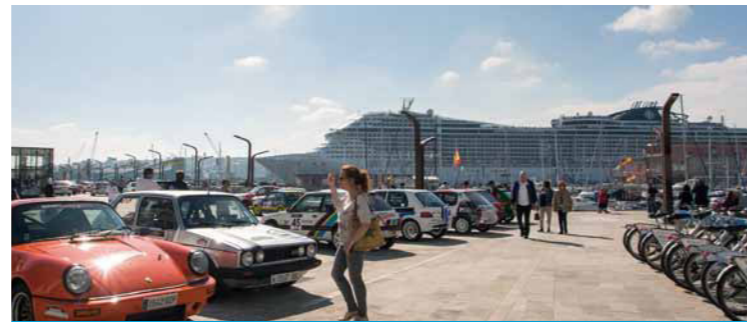
Rias Altas Historic Rally Car Championship (October 2017)