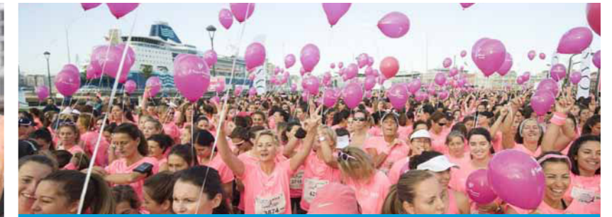
Women's Running Race (September 2014)