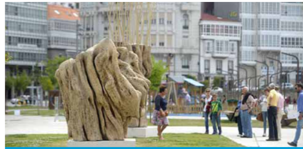
Sculpture exhibition "A carón do mar" ("By the sea", August-October 2016)