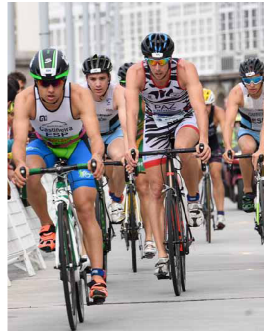
11th edition of "Town of A Coruña" Triathlon event (May 2017)