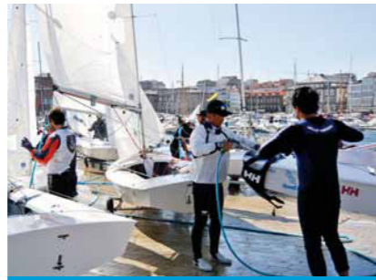
Snipe World Championship (August 2017)