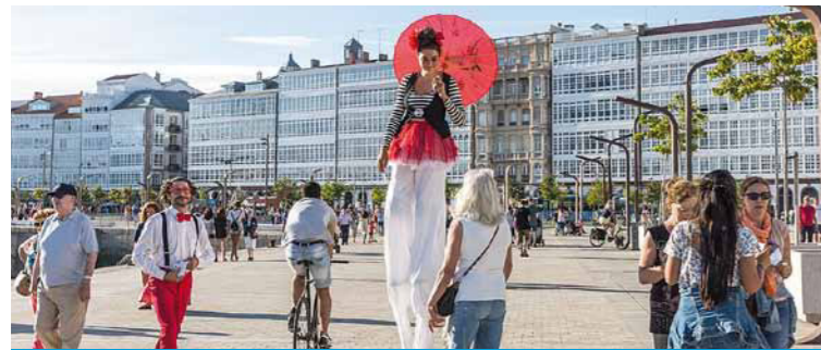
Utopia's celebration (cultural exhibition, August 2017)*