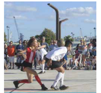
Summer festival (August 2017)