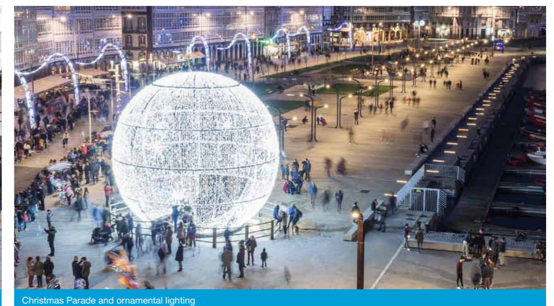
Christmas Parade and ornamental lighting

The new waterfront welcomes tourists arriving to town aboard cruise ships, over 184,000 passengers in 2017, providing an important source of income for the town.