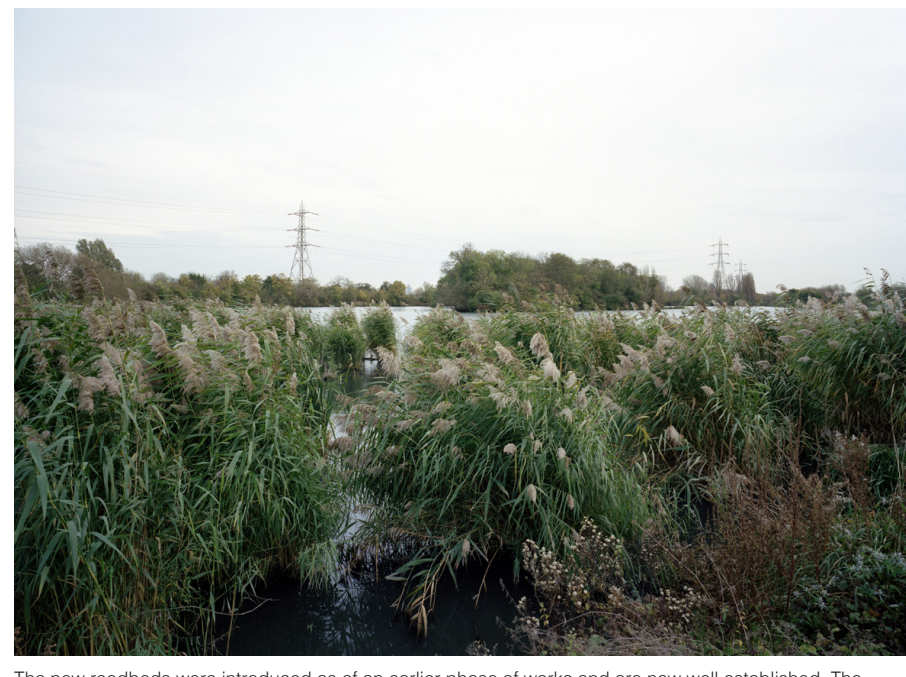
The new reedbeds were introduced as of an earlier phase of works and are now well established. The reedbeds were part of a wider ecological vision for the site