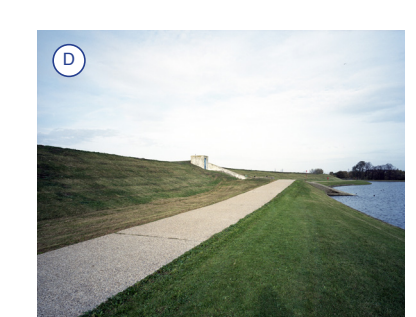
There is a new cycle/pedestrian route of exposed aggregate concrete