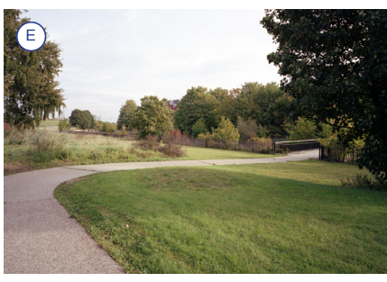
As with all entrances to the site, the bridge at the new entrance at the north of Maynard Lock, crosses over/encouters water