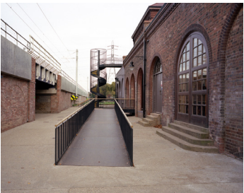
weathered steel plate of the entrance steps and ramp