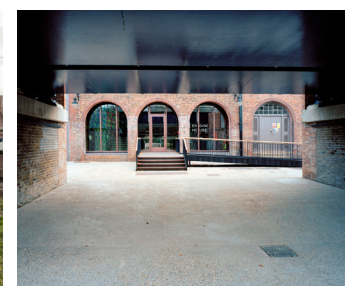
Visitors pass under the railway line on Exposed aggregate concrete and the approach to the Marine Engine