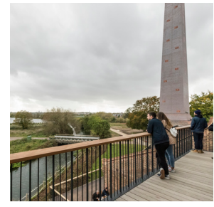
The first floor balcony off the Triple Engine Room, with deck and balustrade that are consistent with the boardwalk