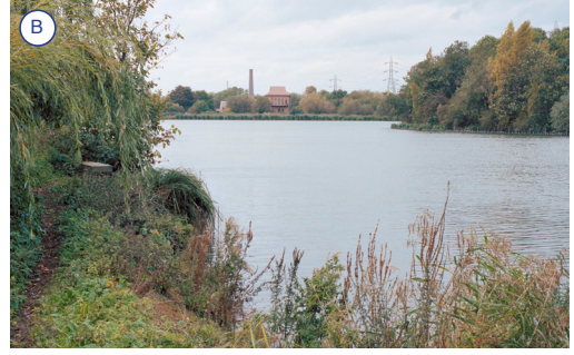
A vantage point at the edge of Reservoir no. 1 looking towards the Marine Engine House