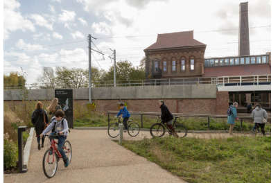
The main route is of generous width to allow shared cycle and pedestrian use