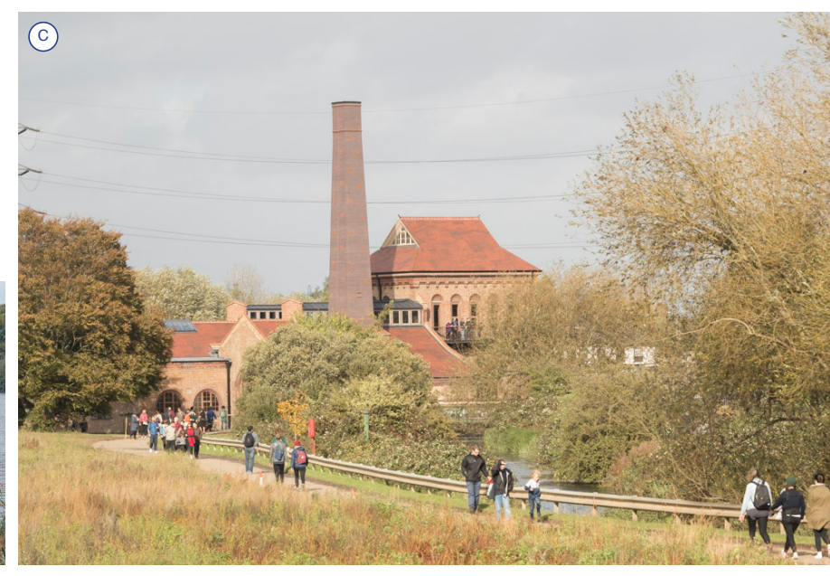
The main pedestrian/cycle route from Copper Mill Lane to Marine Engine House