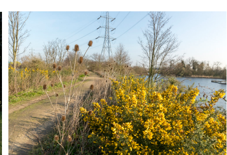
Gorse was planted beside the reservoirs to introduce vibrant seasonal colour. The main pedestrian cycle route was organised to avoid key